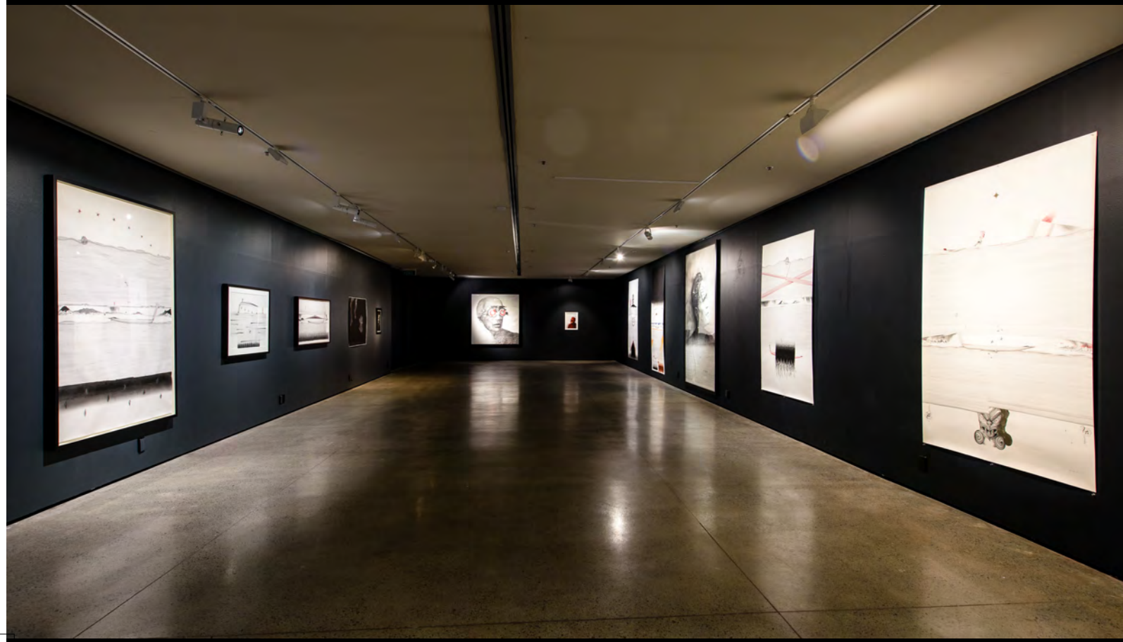
Below: Whakapapa PĀTAKA Art + Museum, Wellington, 2016