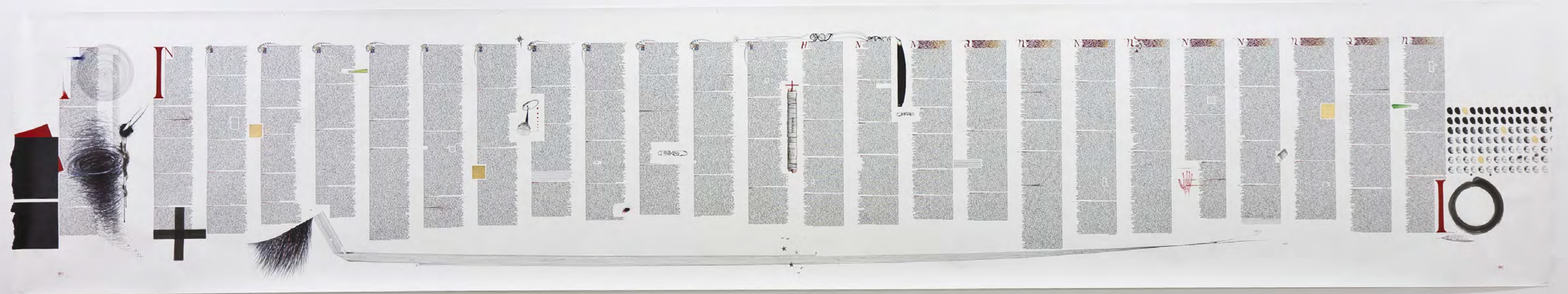
Below: Genesis (Proto-Psaltear V) 2010, Polymer ink, gold and silver on paper, 1.4m.h. x 5m.l., Courtesy of James Wallace Arts Trust, NZ