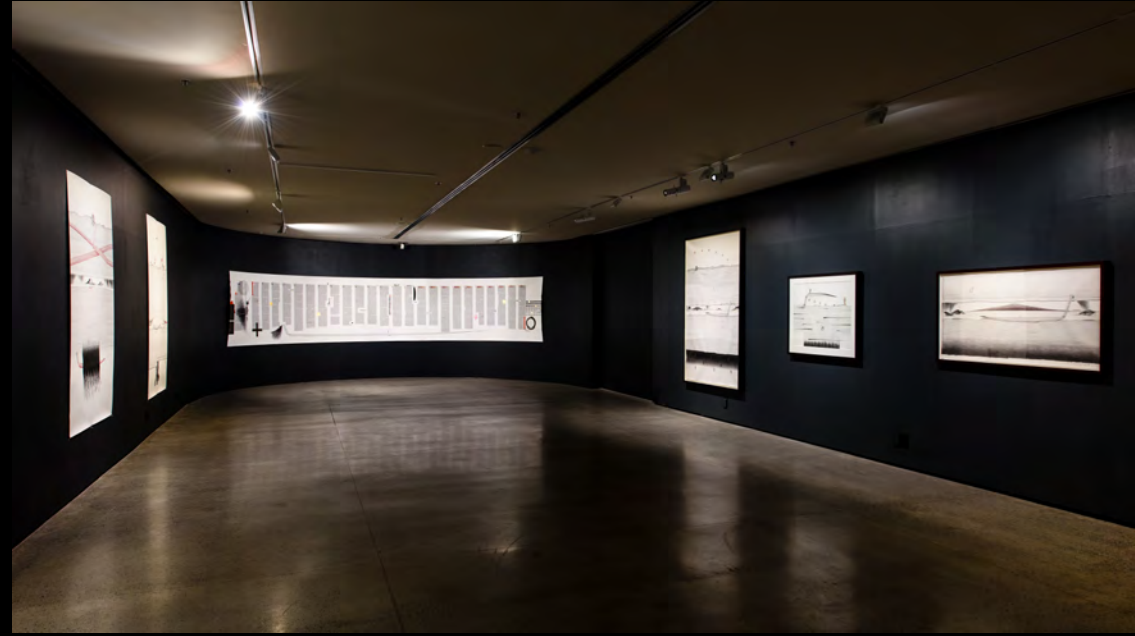
Back cover: Whakapapa , PĀTAKA Art + Museum, Wellington, 2016. Front cover: Roi Tawhiao en rouge 2015, 55cm(h) x 42cm(w) Charcoal, graphite, pigment and wax on paper. Private collection.