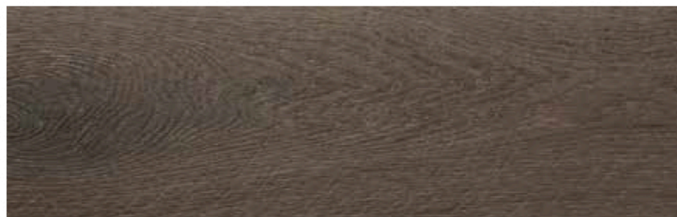
Rugged Brown CW-2007