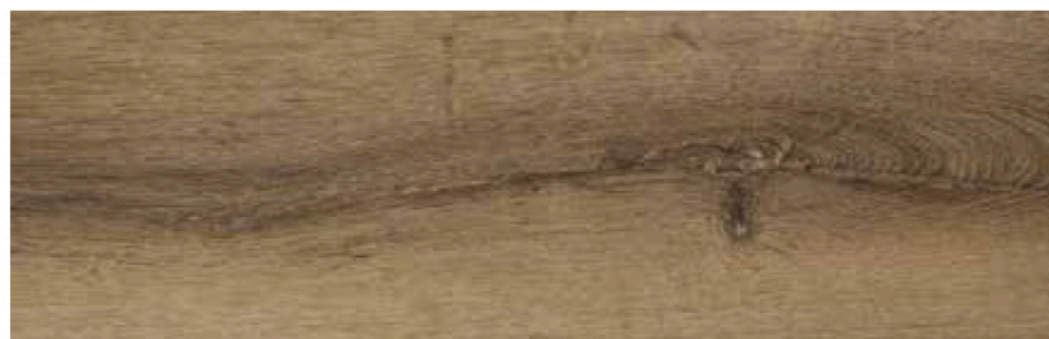
Aspen Wood CW-1997