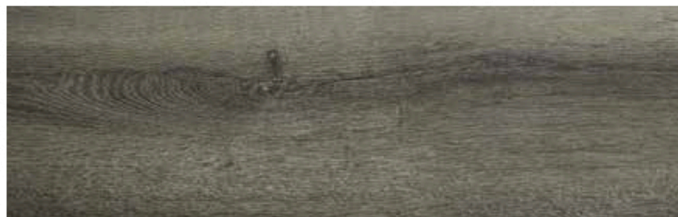
Mountain Forrest CW-1996