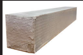
60 x 60mm Hob