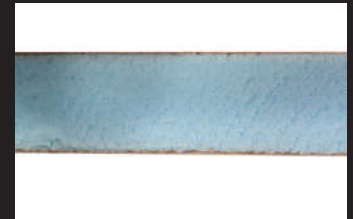
High Density Reinforced Polystyrene