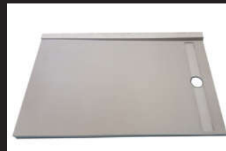
Channel Waste Option