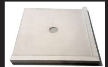
Centre Waste Option