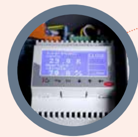
ELECTRONIC EXPANSION VALVE