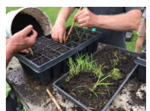
potting our own seedlings