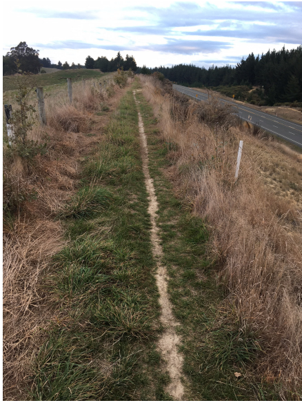
Block 0 from this