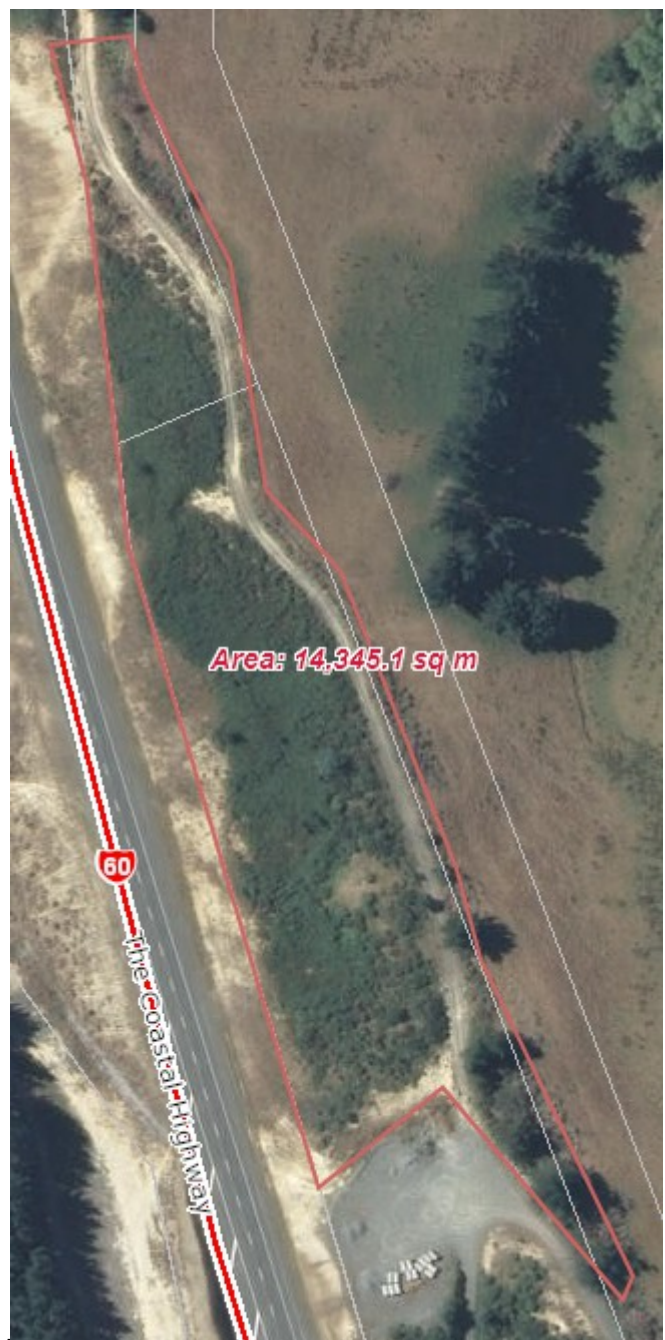
Te Mamaku Drive Native Corridor Project, version 20 Page 9

Permit: TDC, Crown: yes Budget: $ 100 000