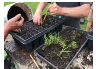
potting our own seedlings