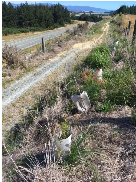
to this, great growth results in 2022!