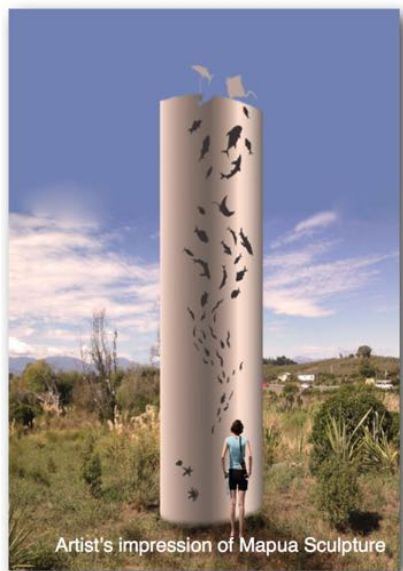
Artist's impression of Mapua Sculpture

The Trust is still working on the resource consent for the Mapua Sculpture in Higgs Reserve and is just finalising the process of gaining approval from the affected neighbours. Once we have secured the resource consent, the next step is to begin the fundraising campaign from both local and external sources and we are hoping to begin construction later in the year.