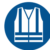
HIGH VISIBILITY CLOTHING