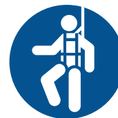
FALL ARREST HARNESS