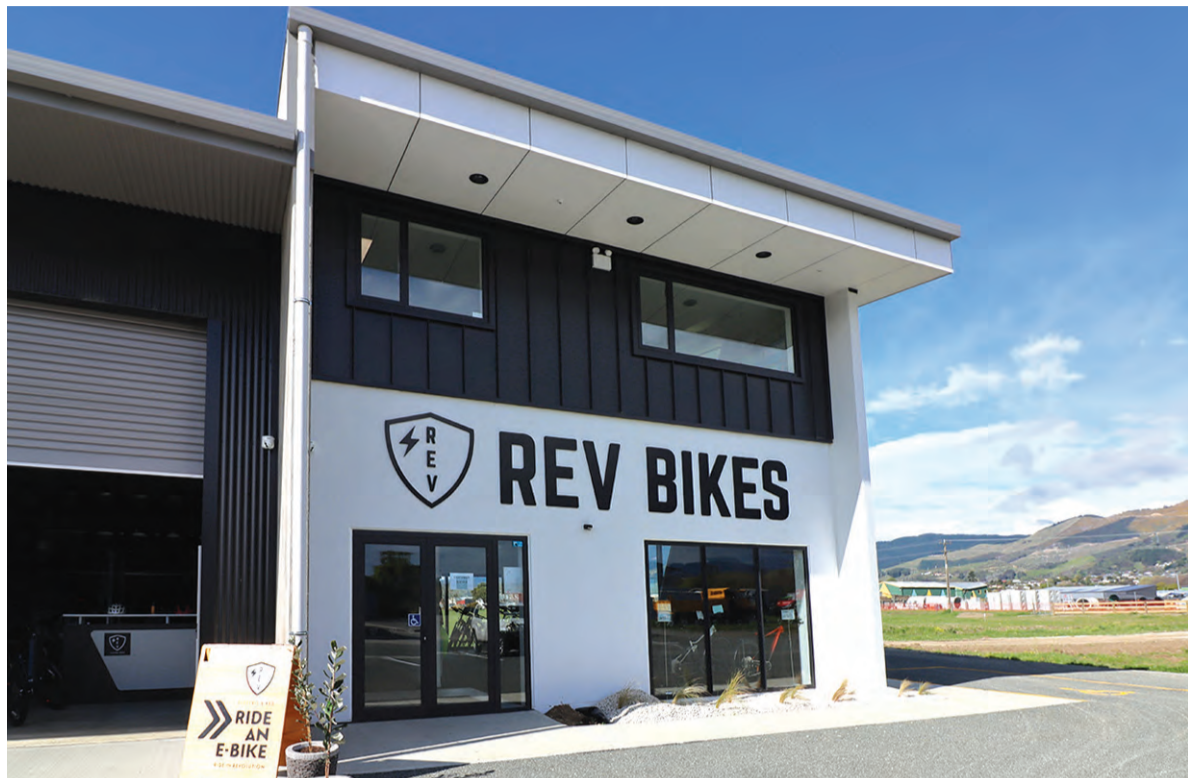
Rev Bike Richmond located at 28 Appleby Highway includes a permanent workshop and showroom. Based just a few metres from the Great Taste Trail, it is the perfect location for customers to take a bike for a test run.