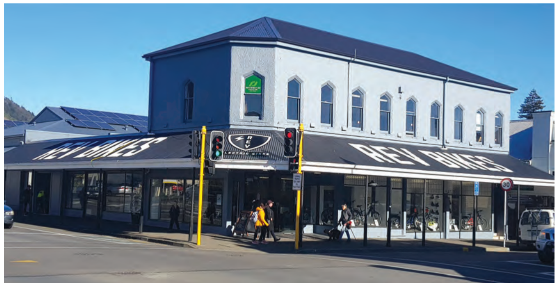
Rev Bike, Hardy Street store in Nelson.

To find your local stockist visit: wattwheels.co.nz