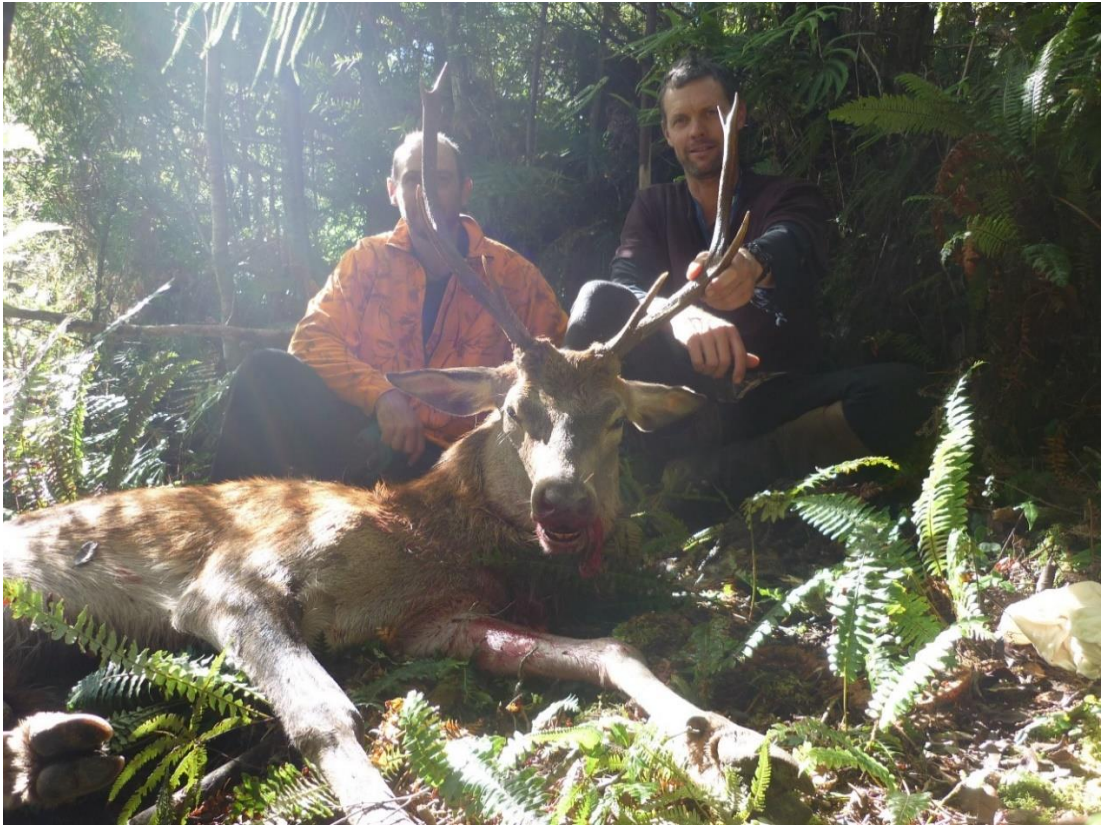
“That’s what we’re here for innit?”