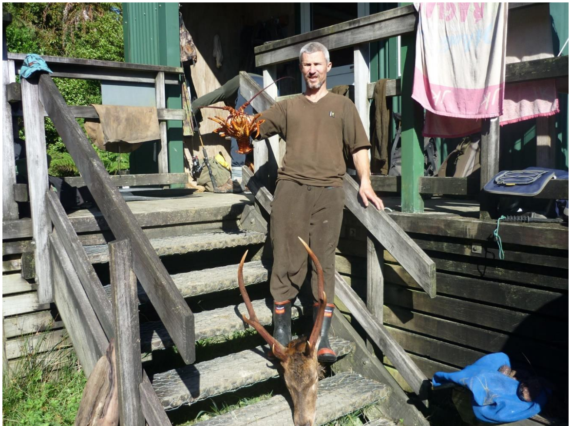
Who could complain eh?