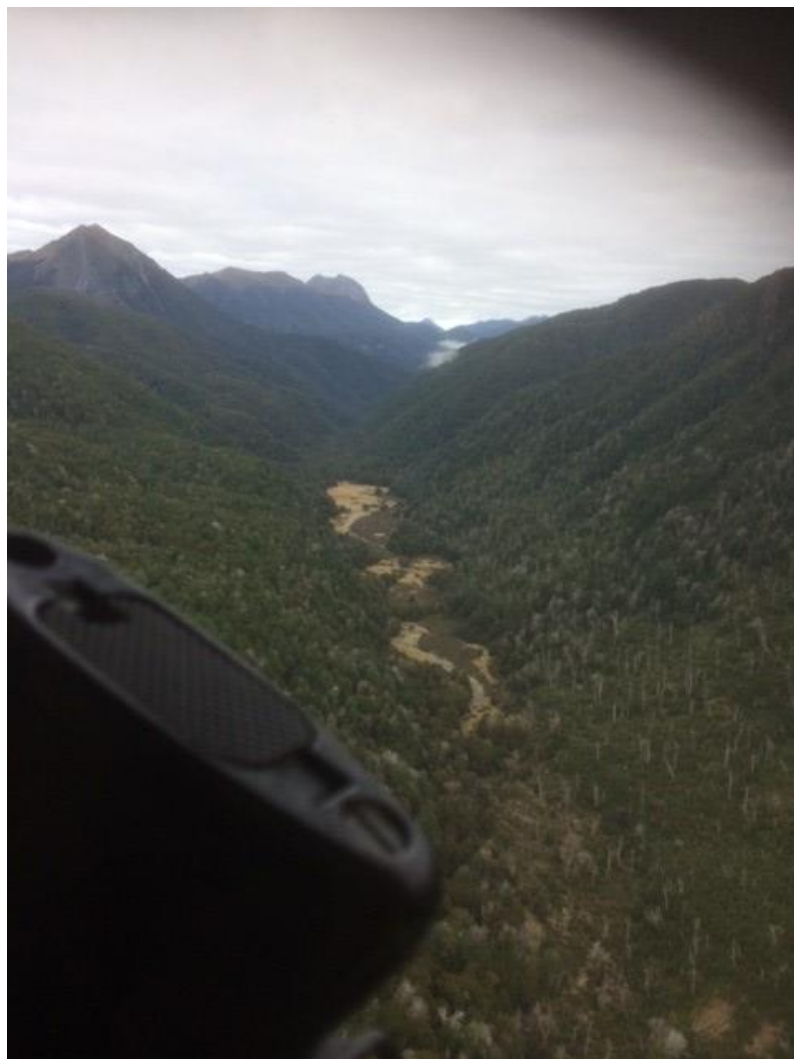
Birds eye view Crow Clearing 3/5/2021