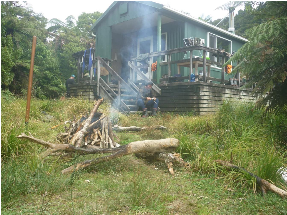
Stafford hut, south of Jackson's Bay Info Here

Those blocks with huts are a bit easier (although often more popular year-round so hunted harder) but offer a great break away with a range of experiences. The chopper guys at Haast know all the ins and outs and several places a not unreasonable walk too.