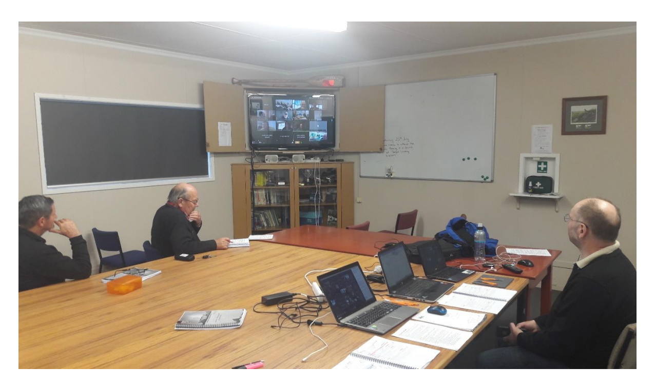
Zoom National Conference and AGM at the Fish and Game rooms