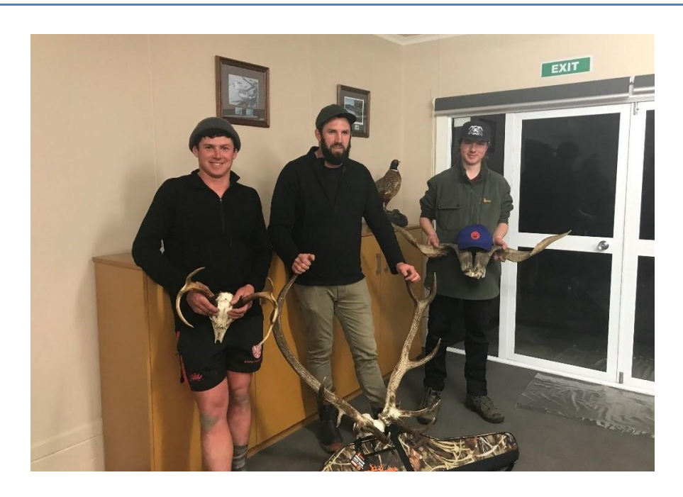
Kelly Country winner of great Spika guncase

Thanks Kelly Country for your spot prizes!