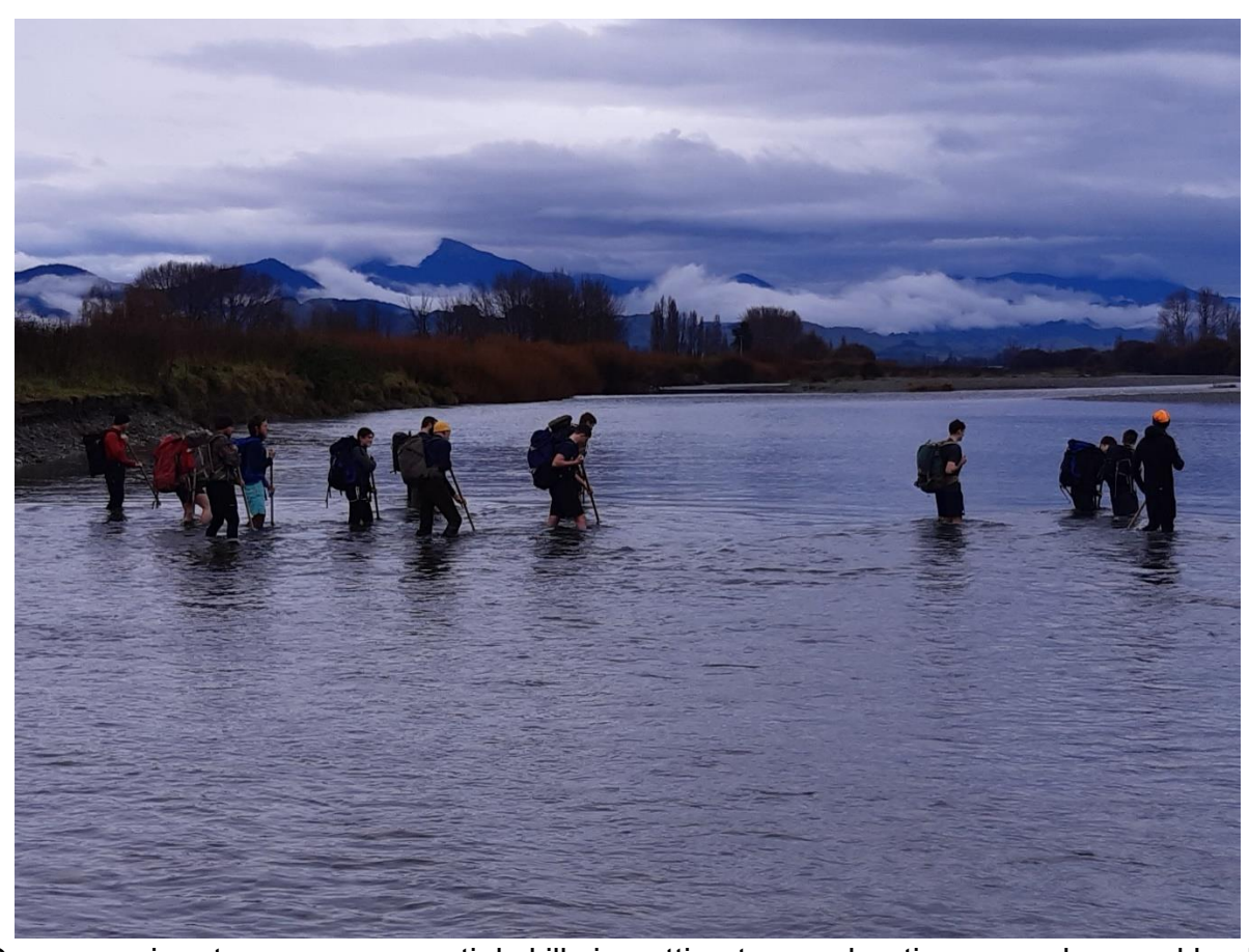
One more river to cross....essential skills in getting to your hunting grounds....and back.