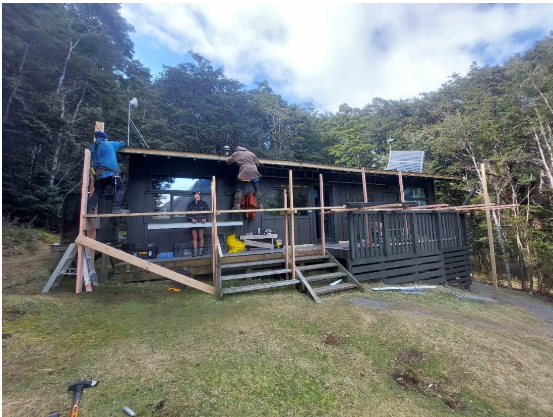
New guttering for the weather side of NZDA Mid-Greenstone Hut