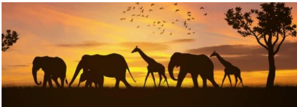
Past big game hunting guide Wille MacDonald presents.

Club Night - Wednesday 7 pm 30 th October