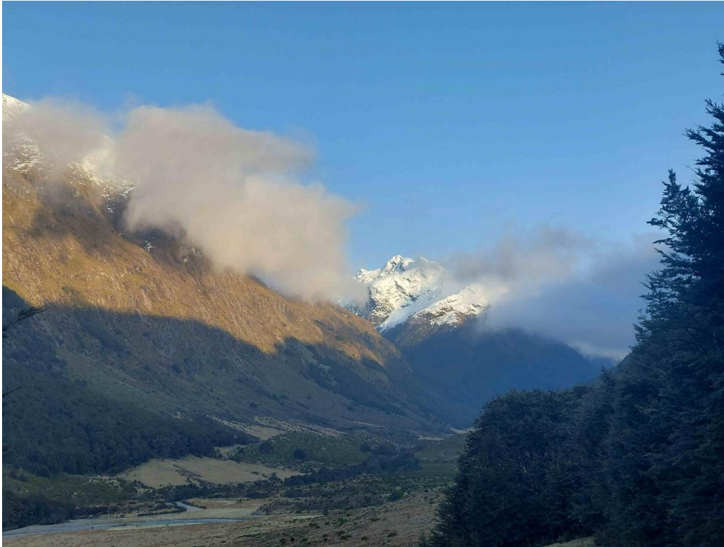
Another peak with no name in our wonderful back country – looking up Greenstone Valley from the NZDA hut