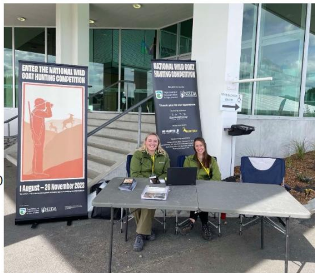
Photo: Prime National Wild Goat Hunting Competition position at the 2023 Sika Show entry door.