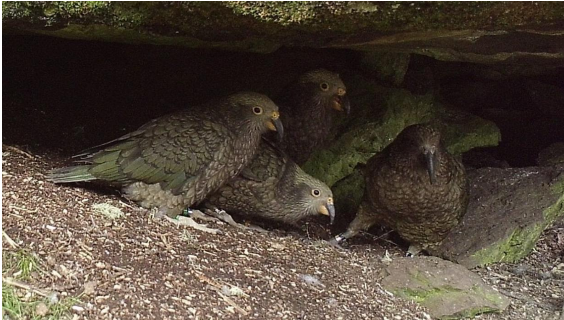
Female kea Scuffle, right, with her three chicks during the 2022 breeding season at Nelson Lakes National Park.