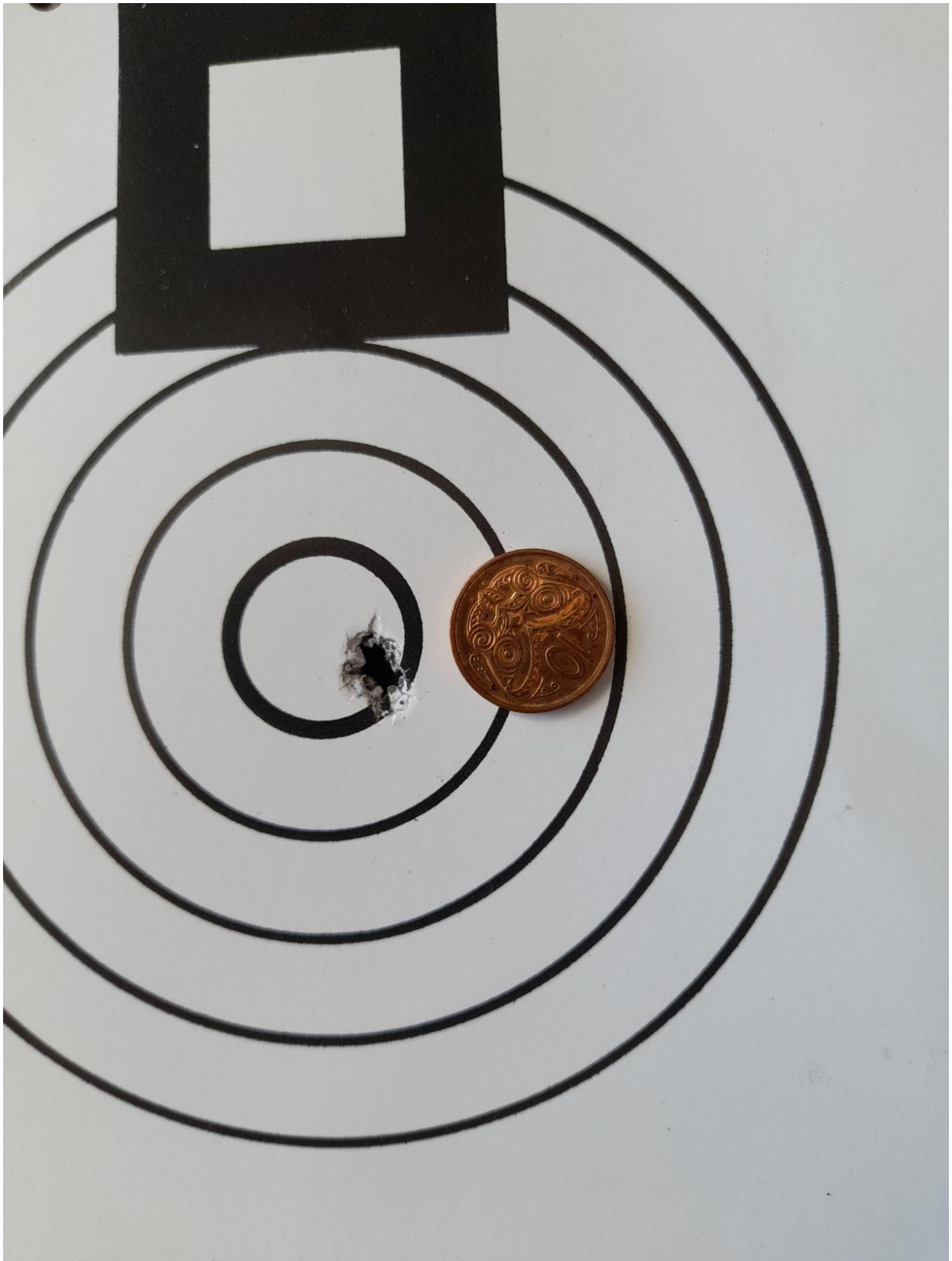
Now that's some shooting – Ian Owen's 5 shots under \frac{1}{4} " at 200 yards!