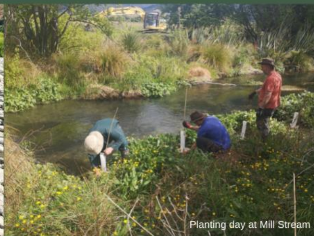
Planting day at Mill Stream