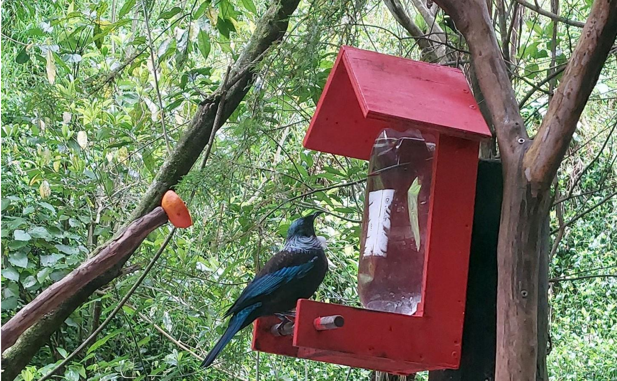
Tui in Jimmy Lee Creek