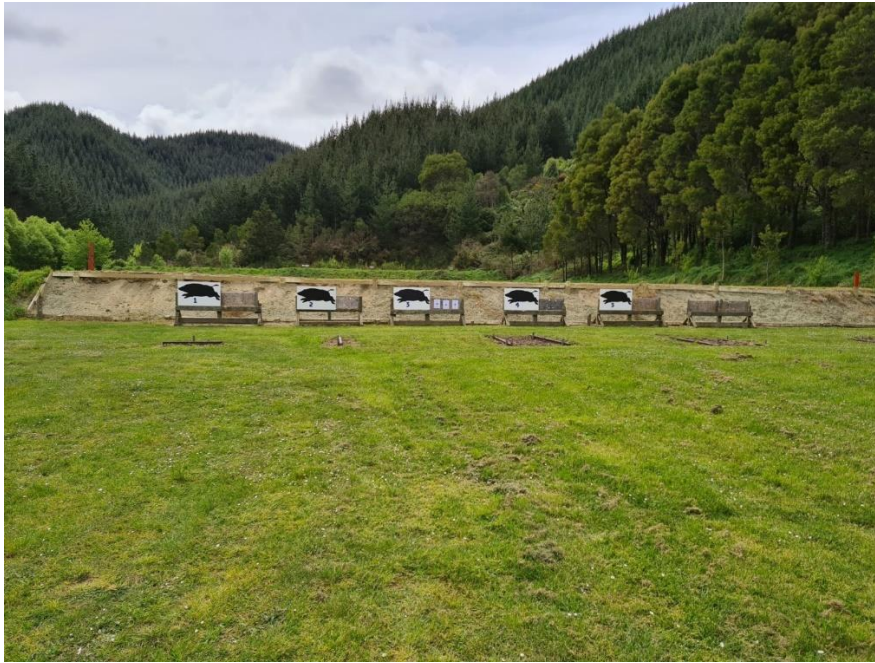
Pigs at a distance!