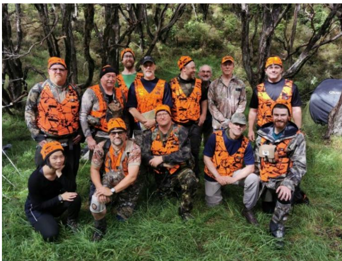
Photo: Wellington & Porirua HUNTS Course 2021