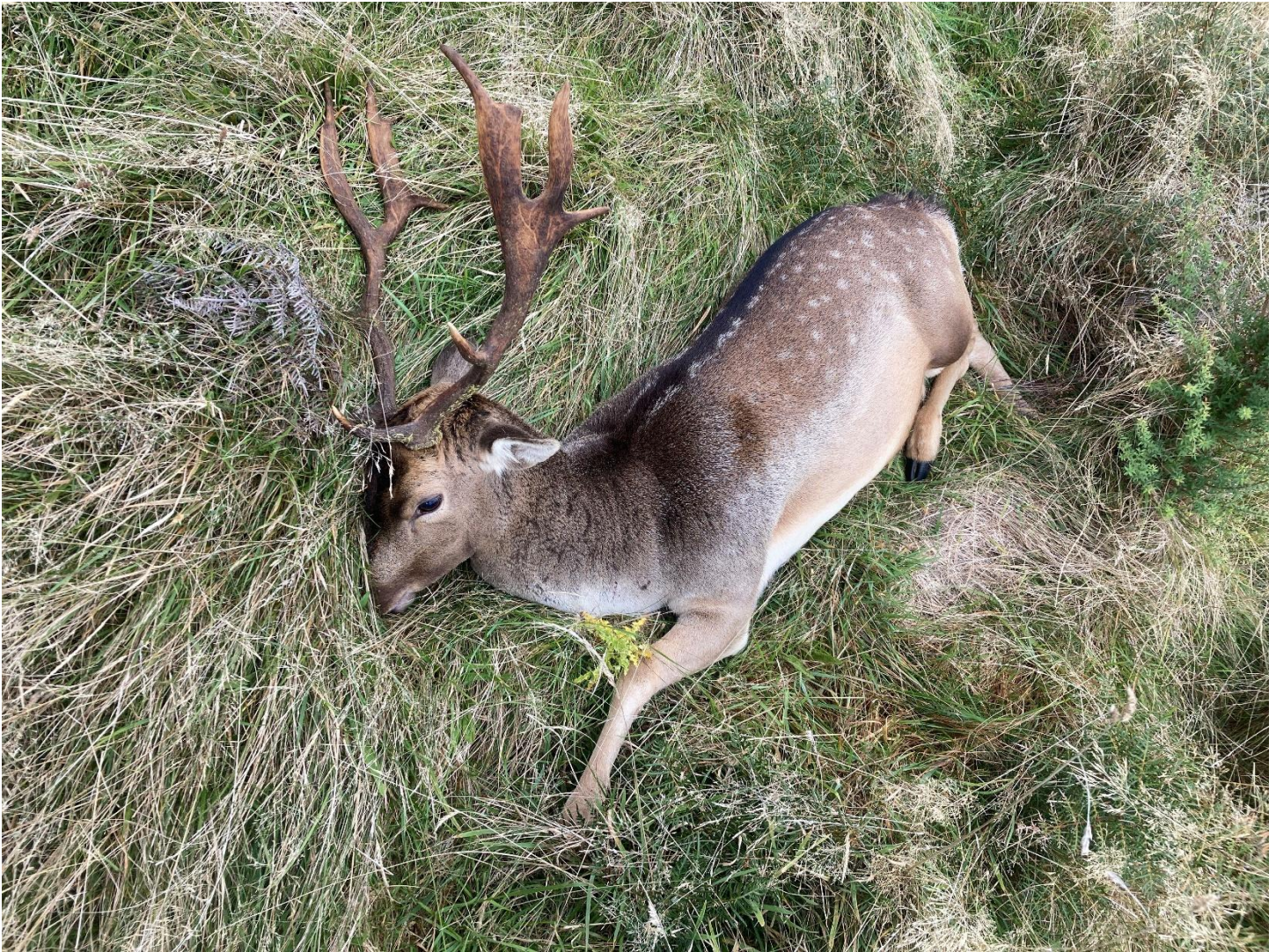
My best Buck to date, fantastic skin to tan & nice head to Euro mount.