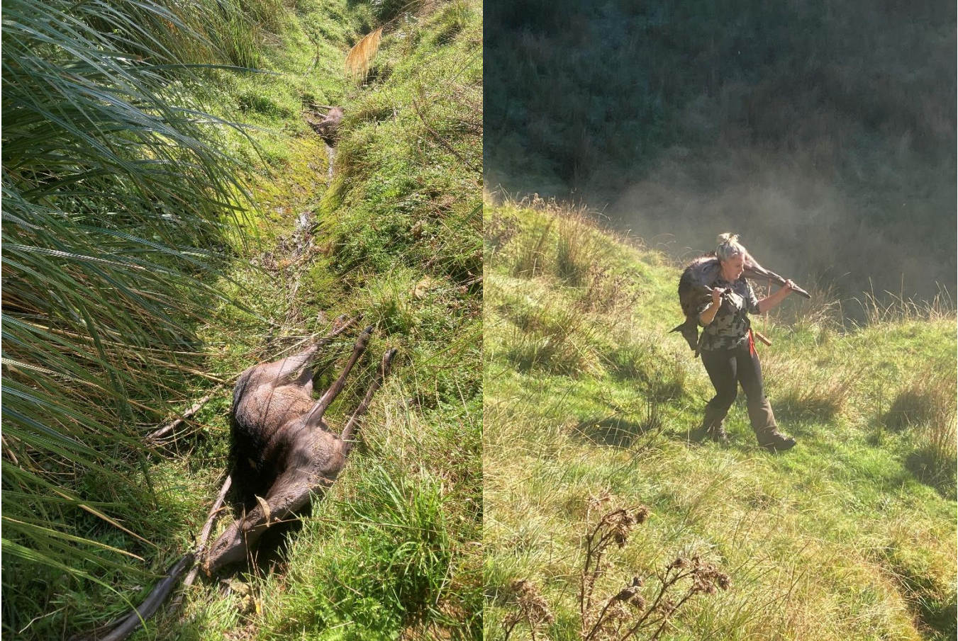
Above - a couple of fallow down and the carry out. Below – fellow fallow hunters.