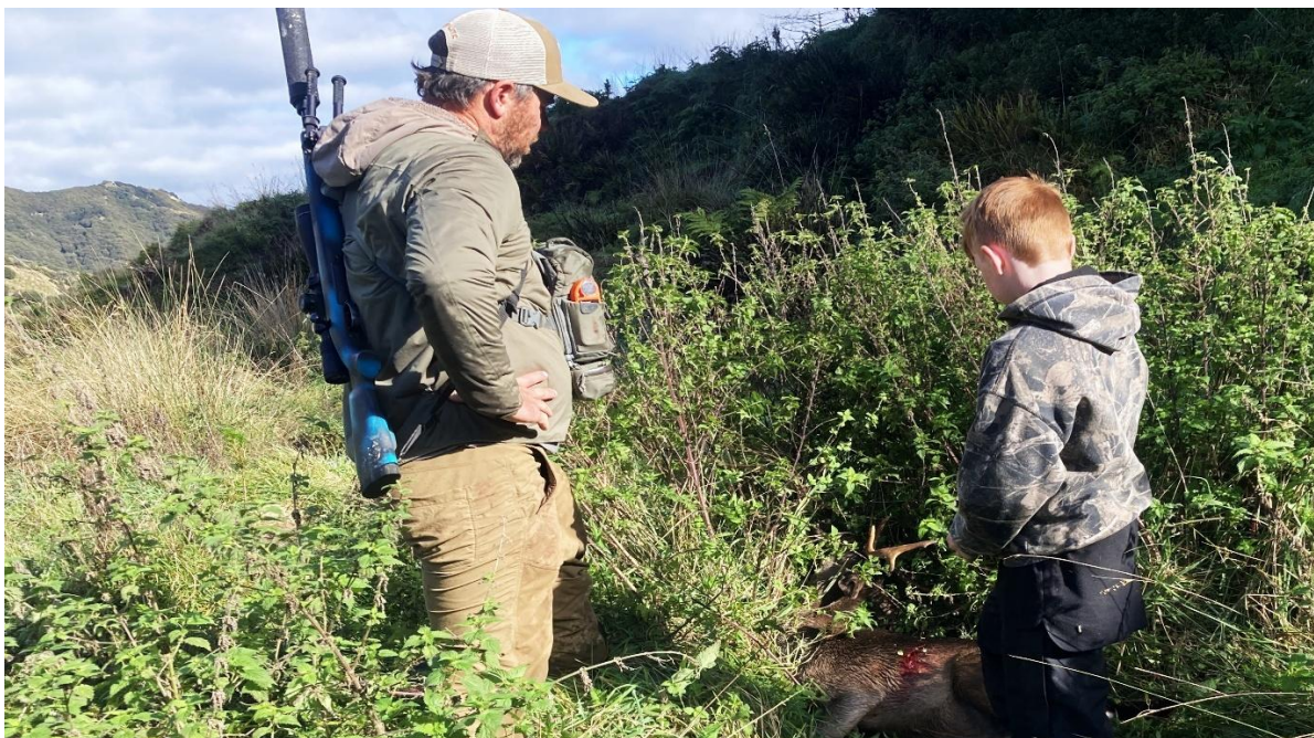
A mate and his son soaking in his sons first buck after a failed stalk the previous day (got to within 15m) and then a successful stalk the next day on the same buck and area for a result.