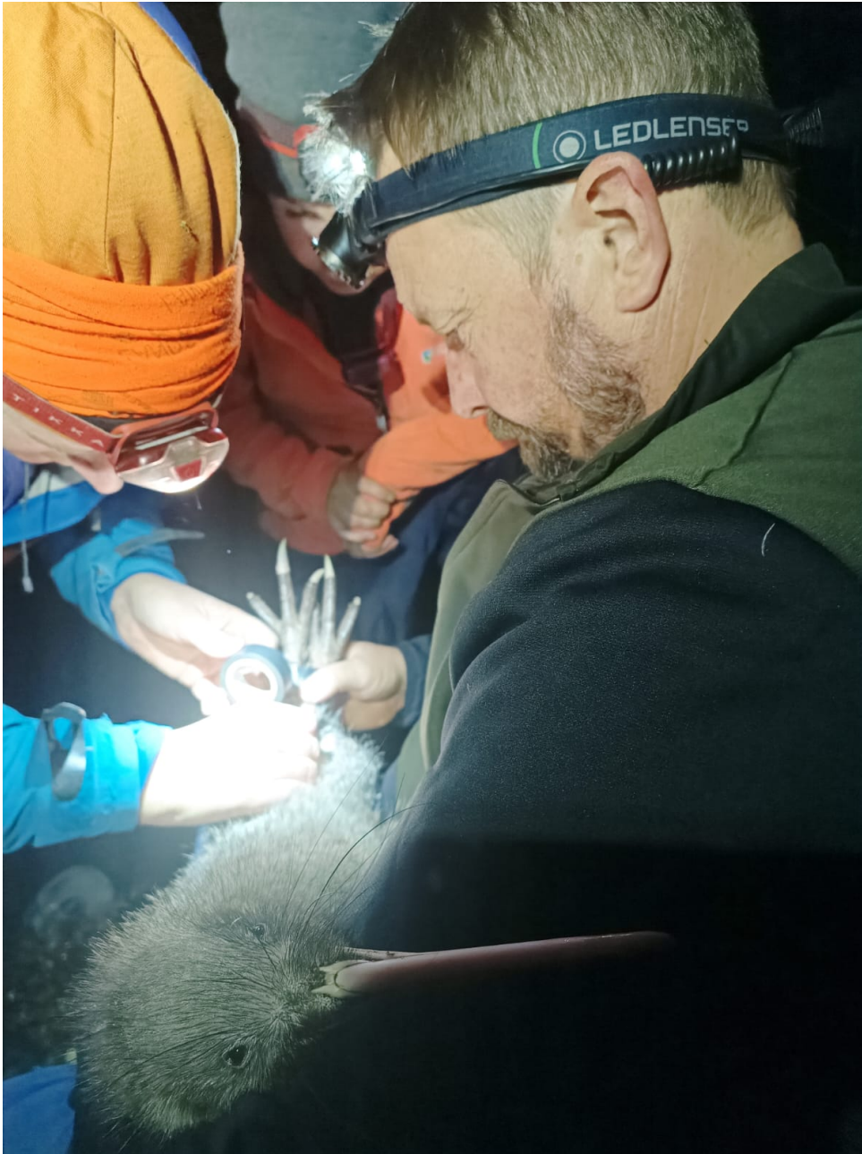
Figure 2. Health checks and attaching the transmitter to a roroa at the catch site.

This is very special and specialised work and would not be possible without the input and collaboration of all these groups of people.