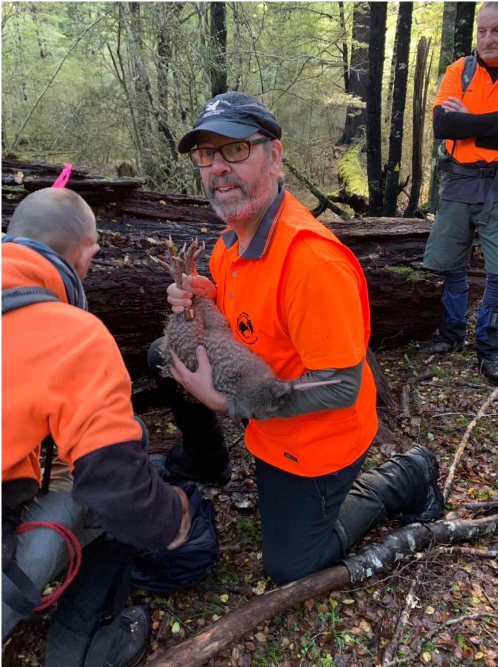
Figure 3. Roroa are put into burrows at the release site and left to rest before the burrow is opened after sunset for the kiwi to explore as normal.

To see more photos and video clips of the translocation, follow Ngati Apa ki te Ra To and Friends of Rotoiti on Facebook and Instagram.