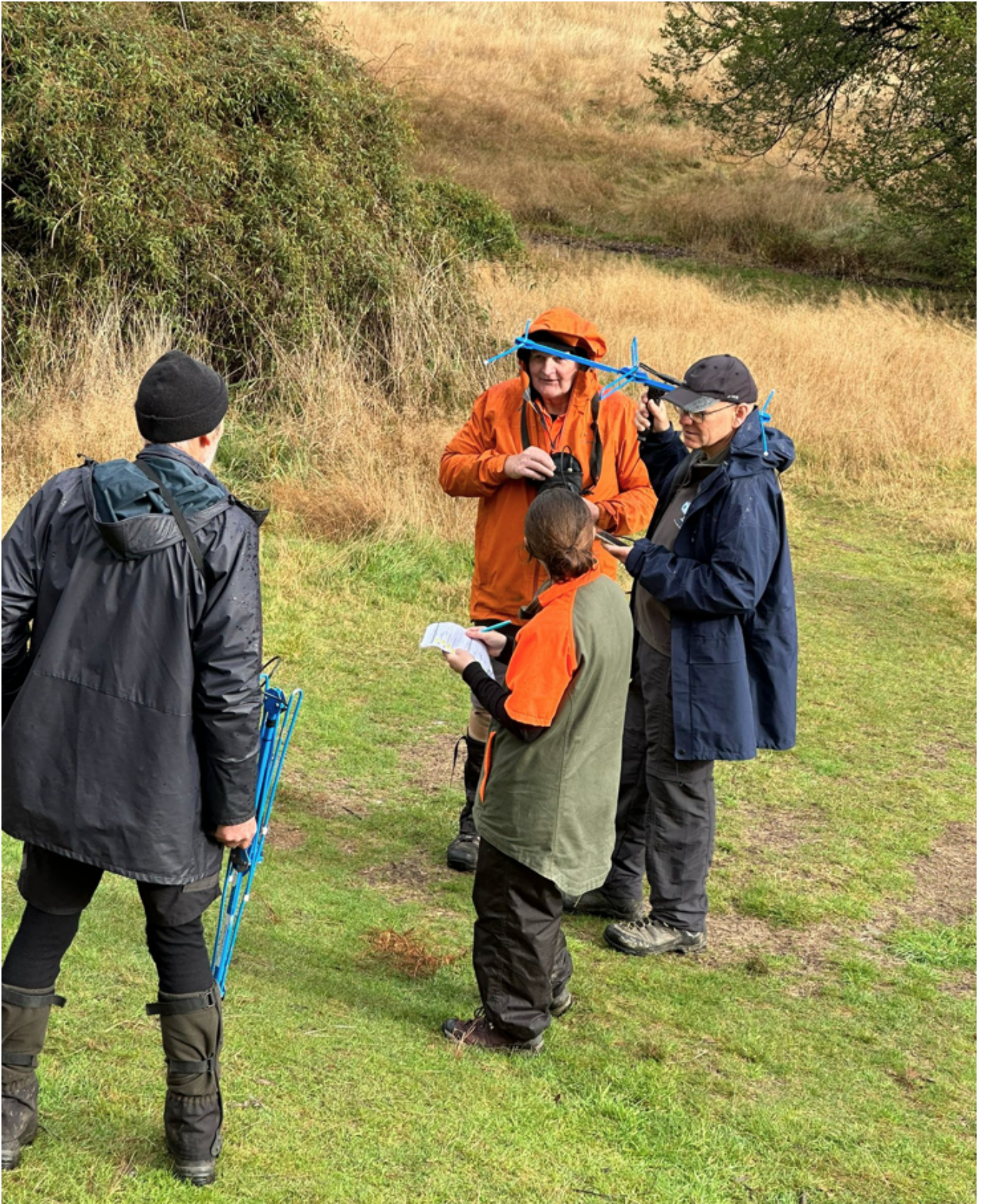
Figure 4. DOC and FOR are excited to learn where the rooroa are settling in