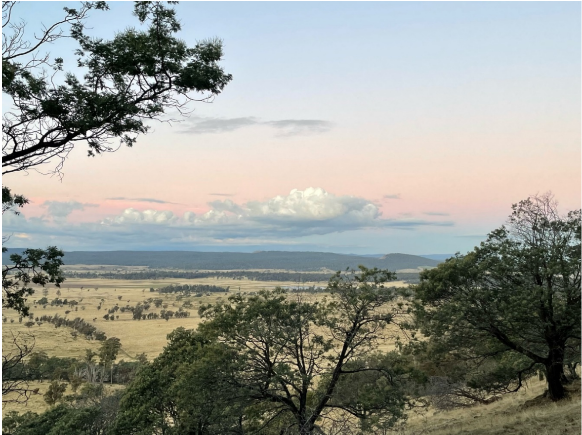
Nice gentle hills compared to the crazy steep of NZ bush.