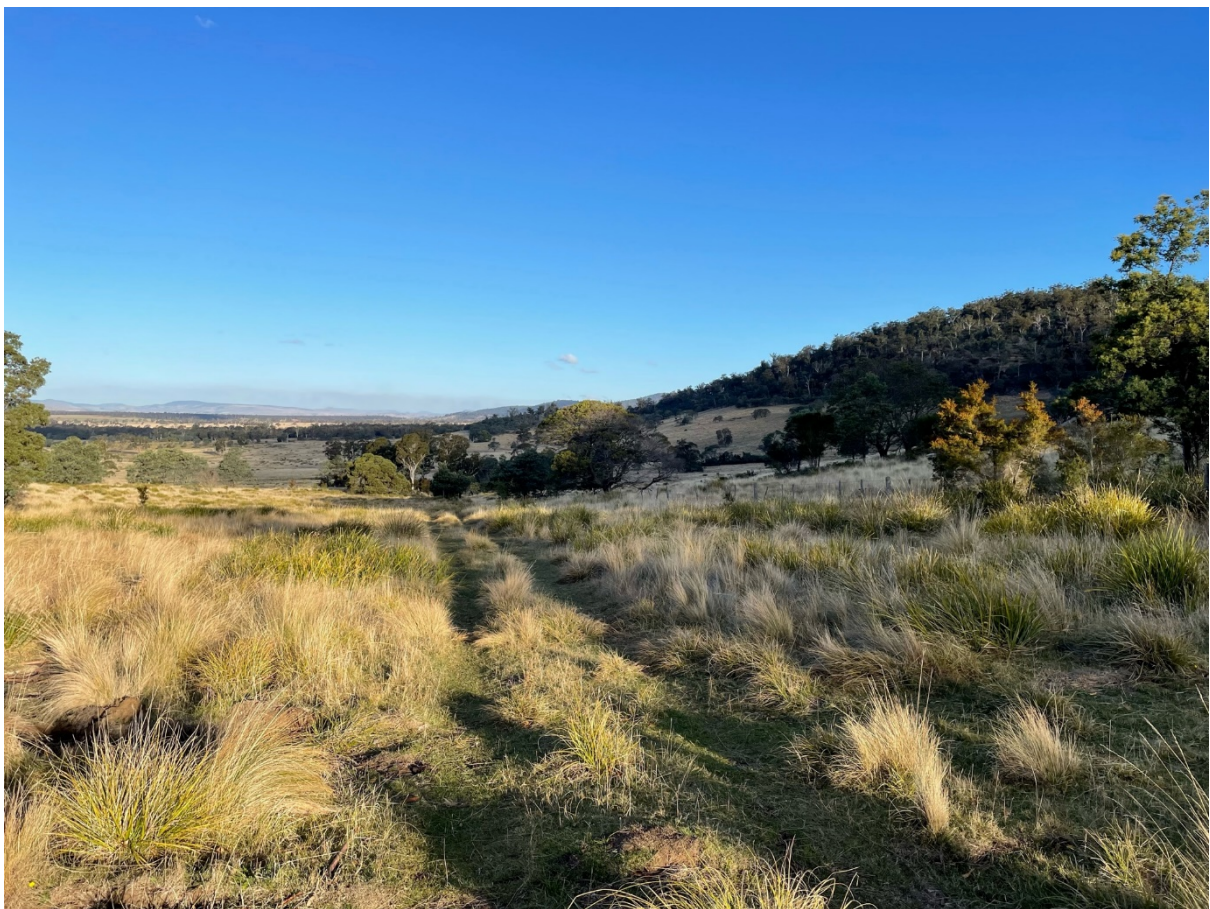
Deer hiding behind every shrub! Fallow habitat in central Tasmania.