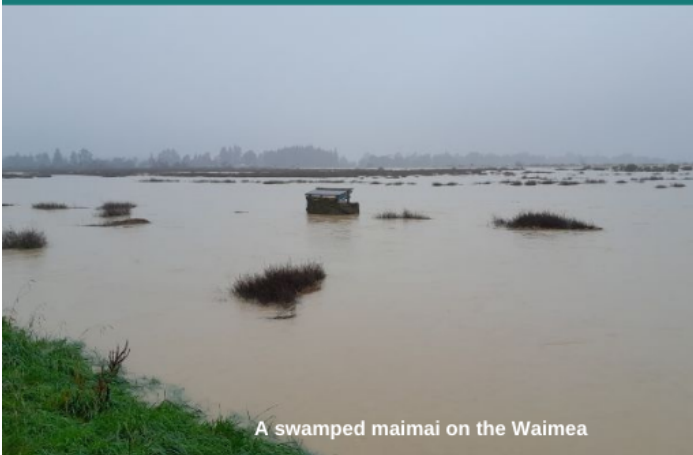
A swamped maimai on the Waimea

WINTER SPAWNING COUNTS UNDERWAY: Over the coming month, staff will be out surveying a range of streams looking for spawning trout. Some of the sites are historical, and others are completely new, which helps build a picture of where spawning occurs. Trout redds are often visible by a patch of clean gravels that have been overturned by trout to make redd.