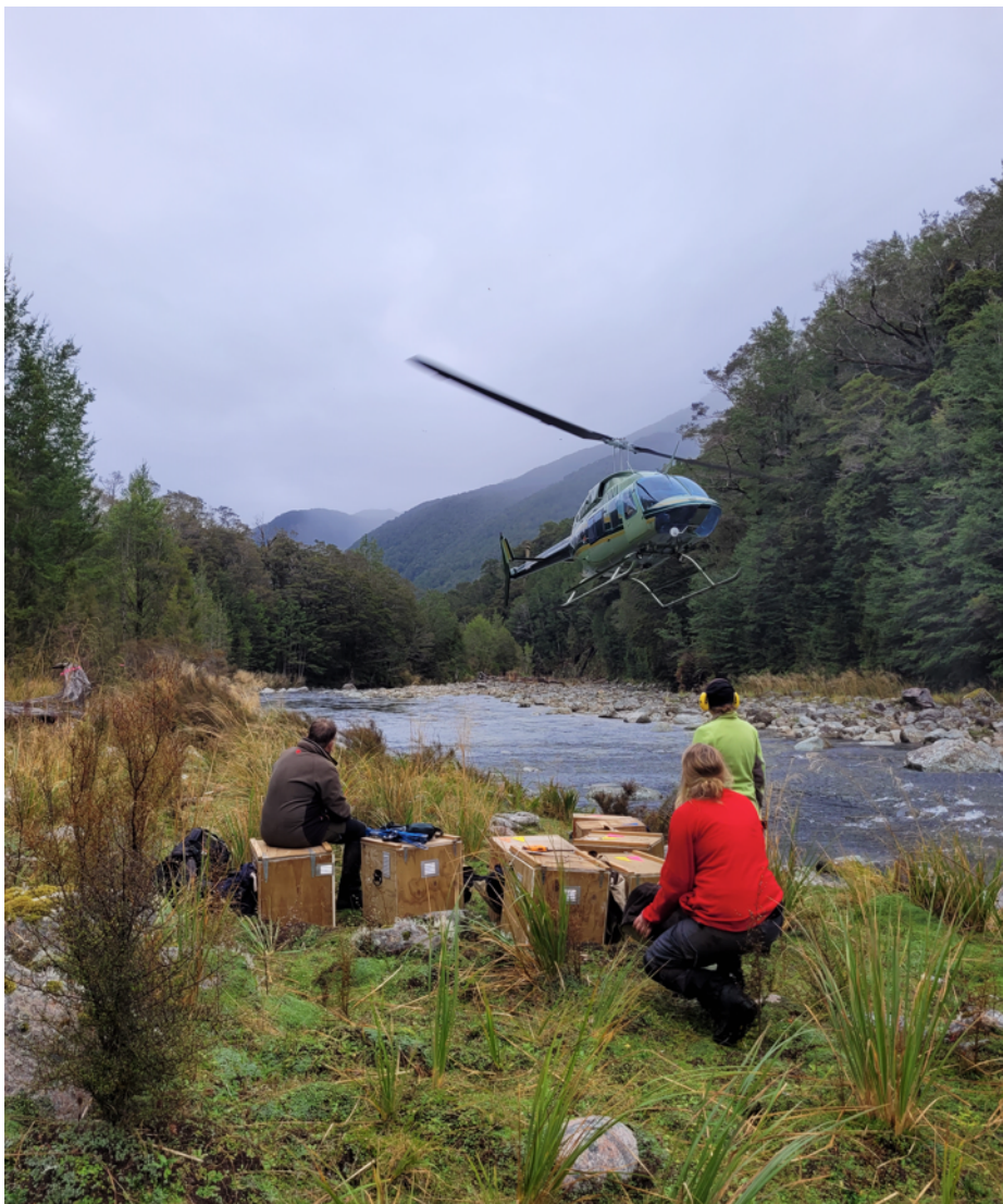
Figure 1. It was an emotional moment for the catching team to see the helicopter arriving to take the birds back to their new home at Rotoiti.

Working with roroa has been very enlightening and we are constantly learning how to best approach the birds' wellbeing when carrying out translocations such as this.