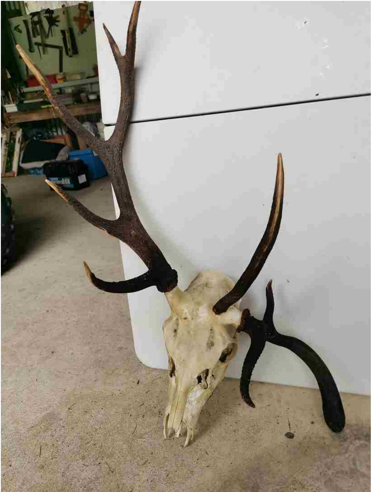
Stag shot locally during 2023 roar, pedicle damage at some stage the likely cause of aberrant growth