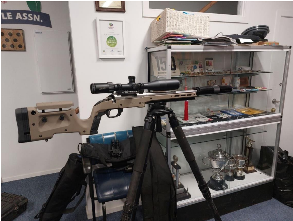
Another PRS rifle.