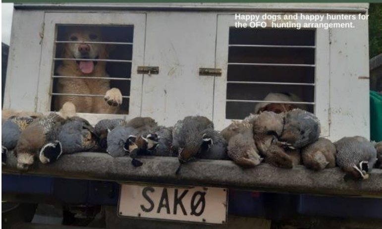
Happy dogs and happy hunters for the OFO hunting arrangement.