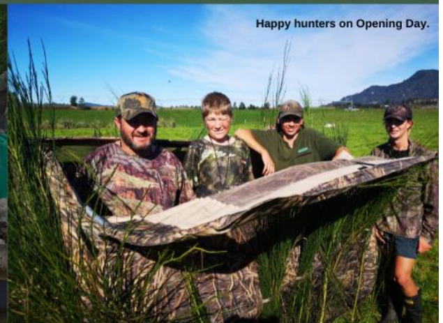
Happy hunters on Opening Day.