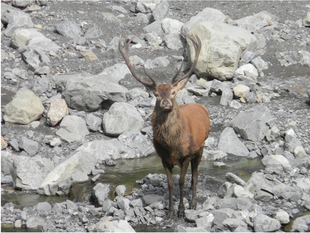
Stag on the rocks