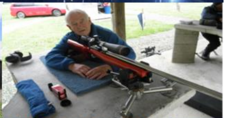
PACKER'S CREEK OUTDOOR RANGE