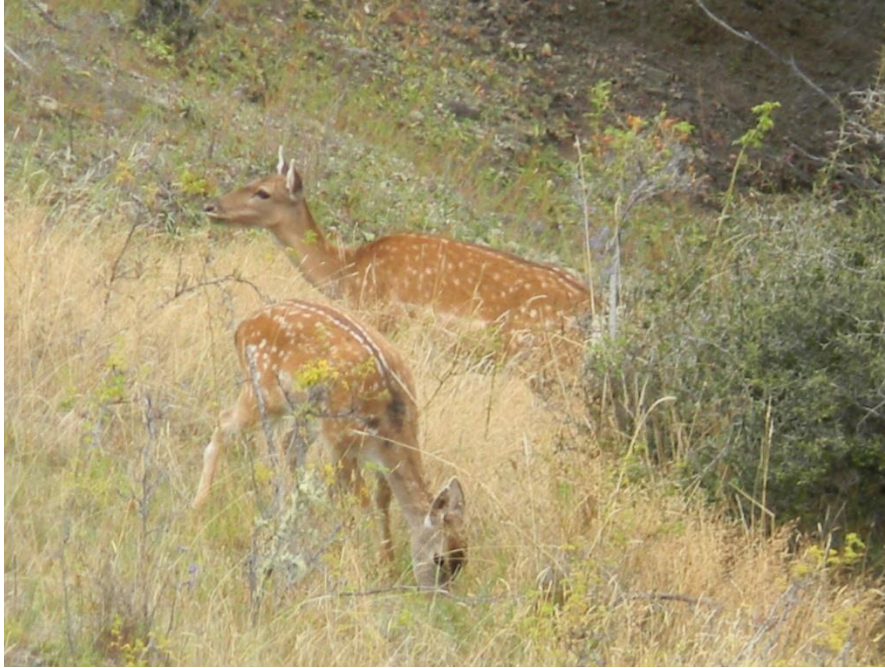
Well spotted fallow deer

Warren told us at Committee that he was “away hunting” for much of March and April.... indeed he was, and what great pics and trophies resulted. A dedicated hunter of few words but many deeds Warren shows what can be achieved on public land with rifle and camera.