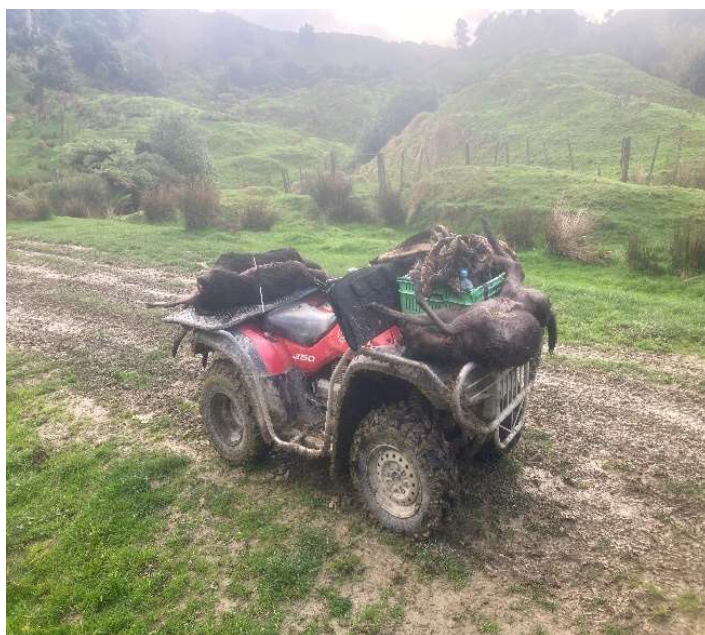
Loaded up and ready to go home

All up just another amazing trip in an amazing place, no trophy heads but lots of meat for all the freezers.