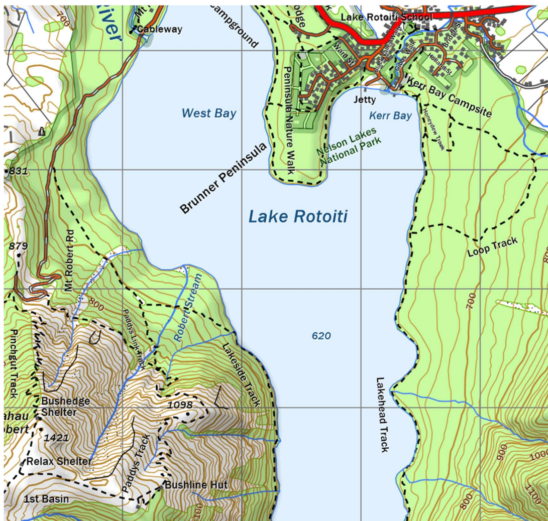
Location of Bushline Hut, bottom & slightly west of centre.