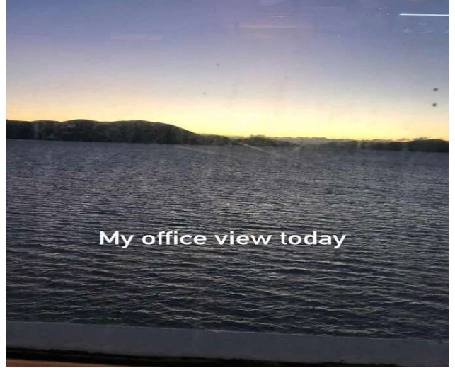
Sunrise on the ferry, front row seats

The weather this time was not on our side with the rain, it had been raining for the best part of a week before we got there BUT this didn't stop the hunter in any of us, we dropped off our gear, got our wet weathers on and headed out for an afternoon early evening hunt.