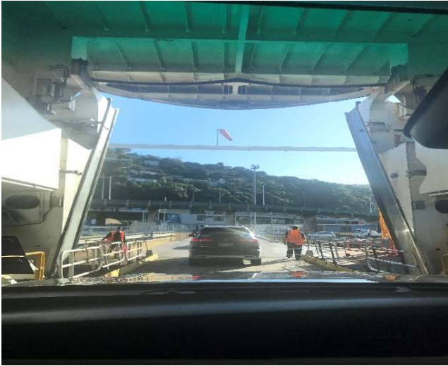
Arriving in Wellington