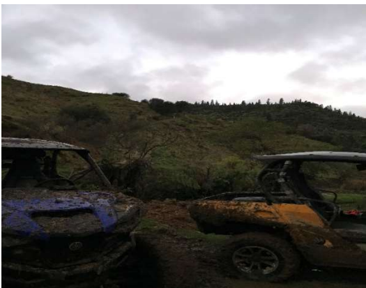
Pretty muddy side-by-sides

At the start of the track I was going great guns for about ten minutes then all of a sudden the side by side started drifting sideways into the bank, a few wheel spins and a turtle head moment I was sliding backwards, sliding down the track - just had to go with it, eventually made it up the track and on our way again and just an FYI it wasn't just me that struggled up and because of that we had to find an alternative way back down in the dark and to top it off it started pouring down - no deer but fun memories.