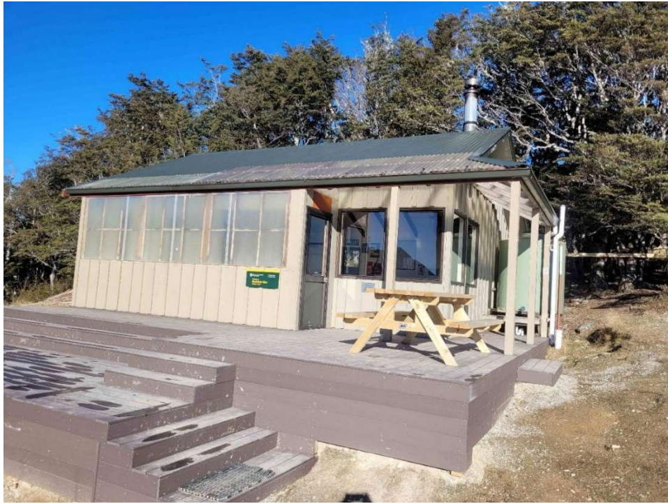
Bushline Hut high above Lake Rotoiti with its great new deck.

A Team Effort Story - Correspondence from three sources regarding this great piece of work.