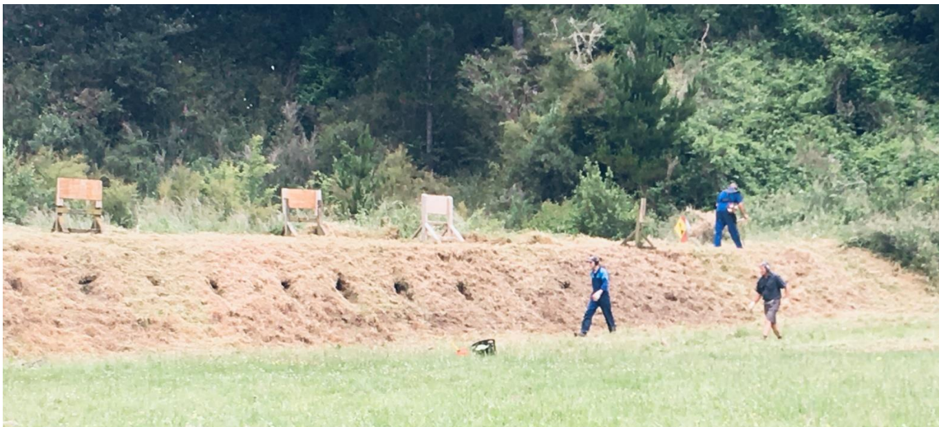
Packers Creek Working Bee Dec 2023