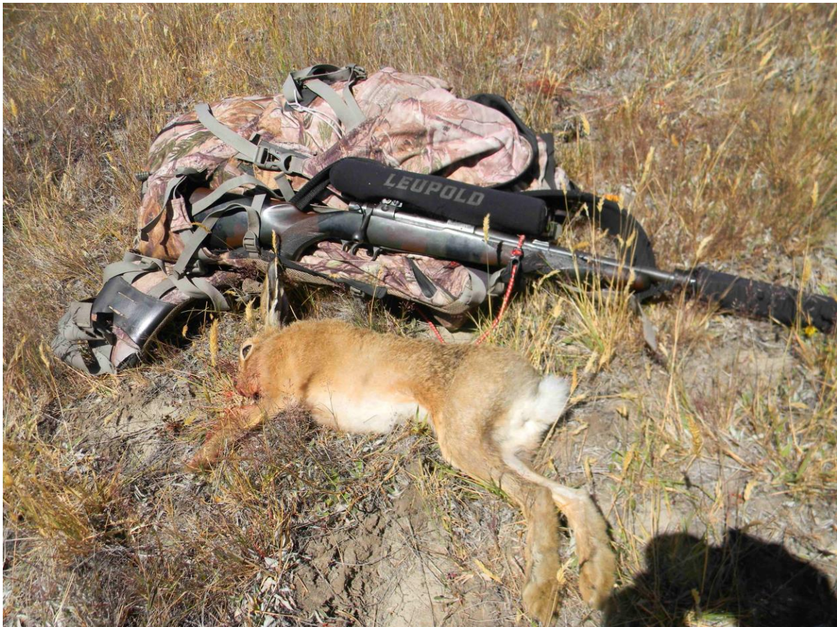
Photo attached along with unfortunate hare I encountered on way out. Had knocked my rifle over on rocks so just checking scope was unaffected.