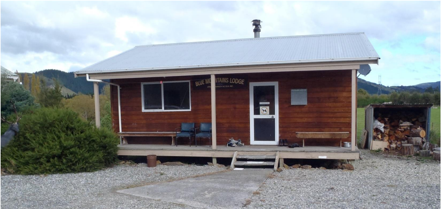
Otago NZDA Lodge at Beaumont – gateway to the Blue Mountains RHA.

Where: Fish and Game clubrooms Champion Road Richmond