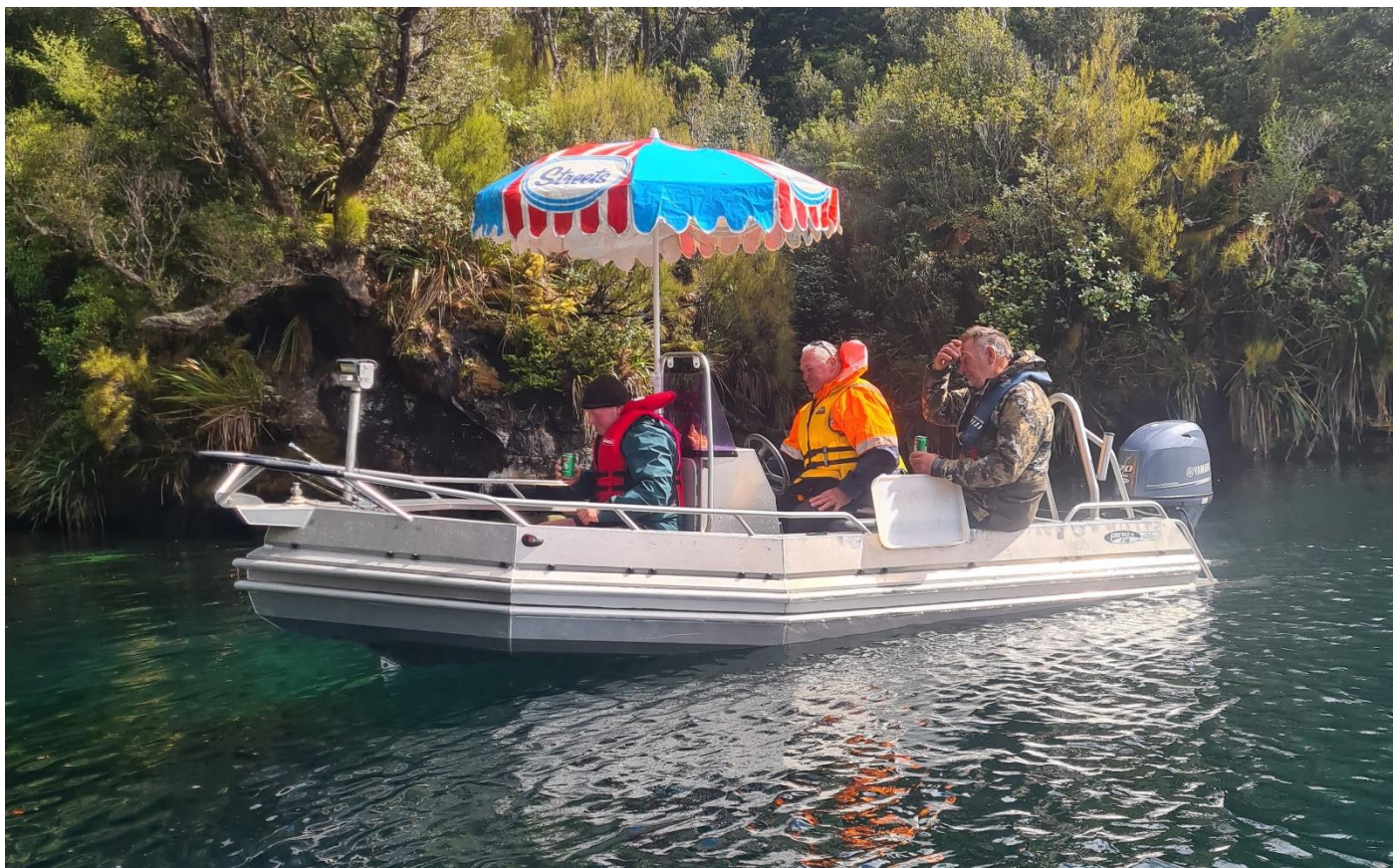
Here comes Mr Whippy! Sun umbrellas are a must down there.