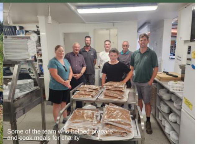
Some of the team who helped prepare and cook meals for charity