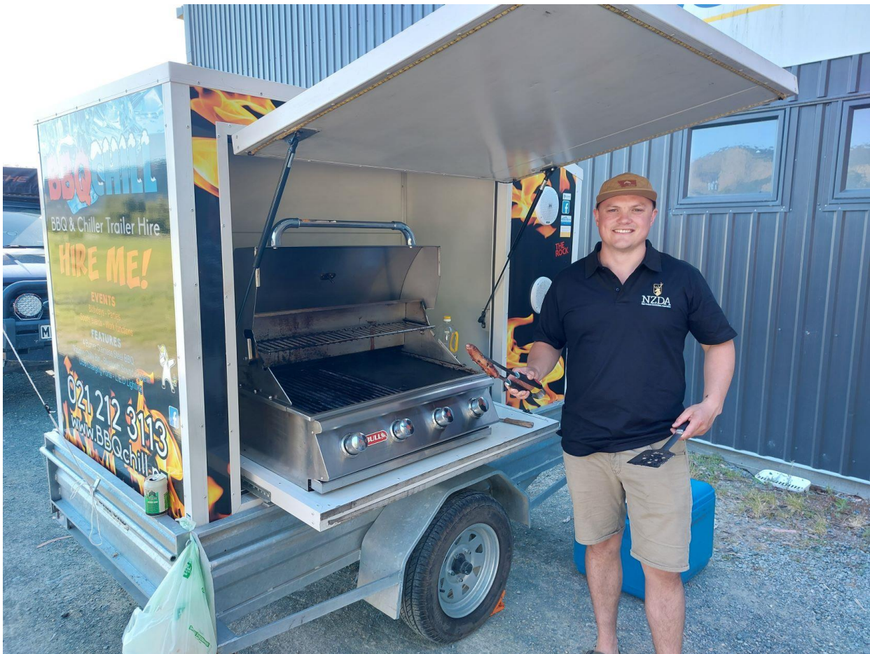
Last sossie from our chef!