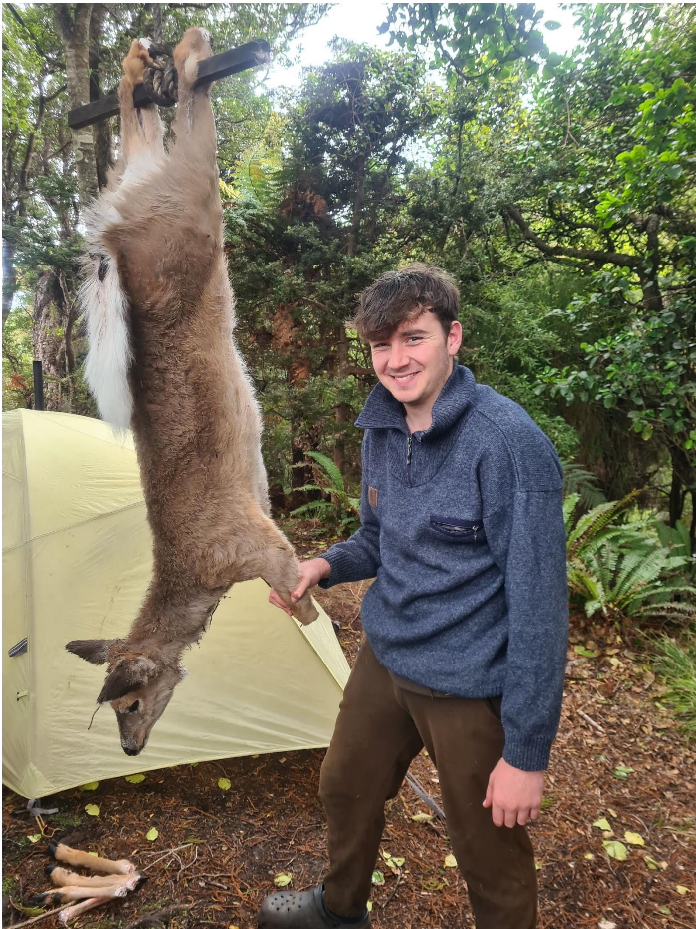
Ohhh yeah...and a nice whitetail or two....