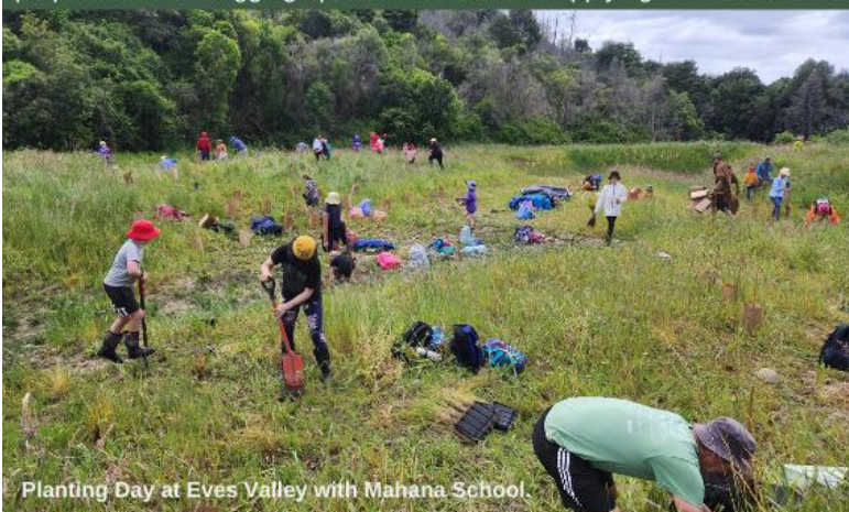
Planting Day at Eves Valley with Mahana School