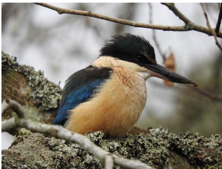
Second Place Cory Jones – “Kingfisher”