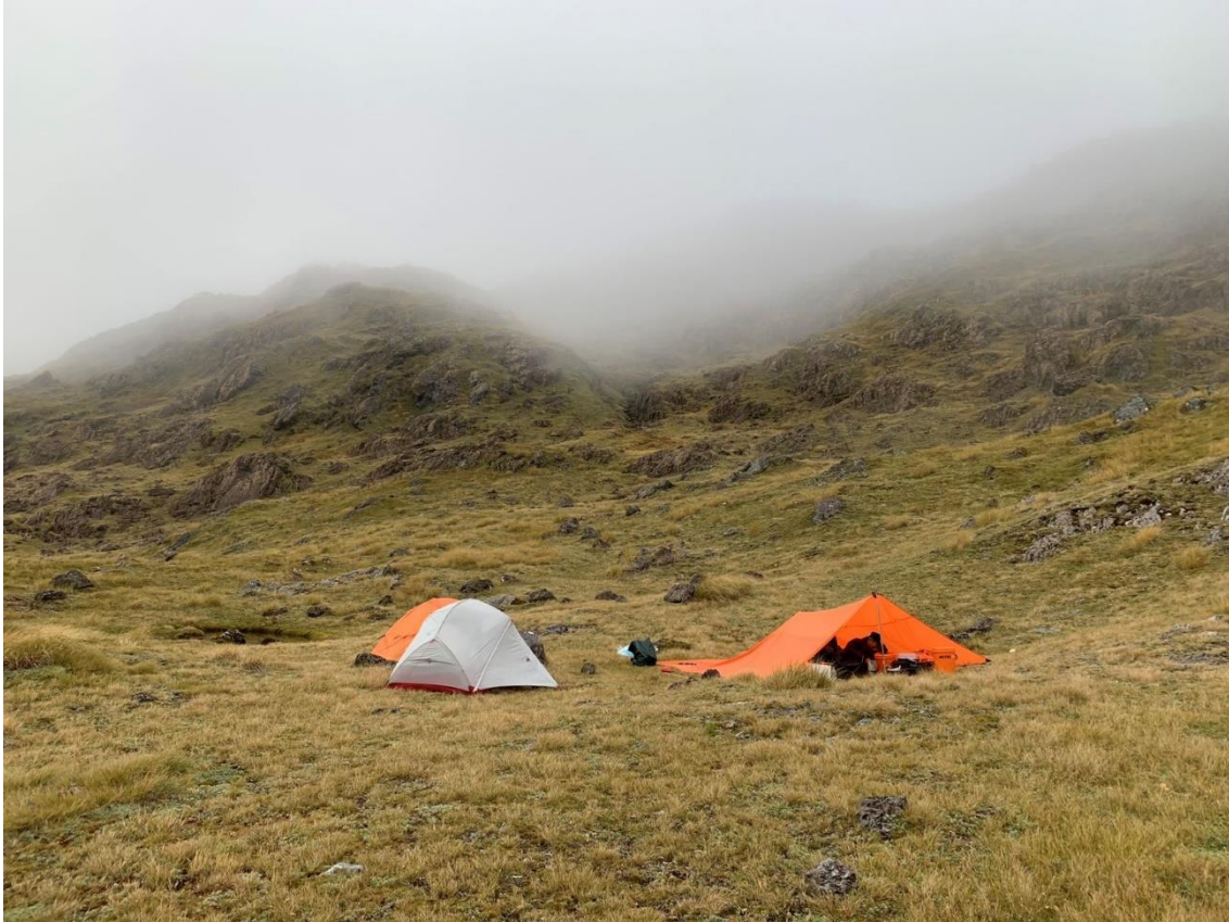
Second Place Aaron Tapper - "Alpine Camp"