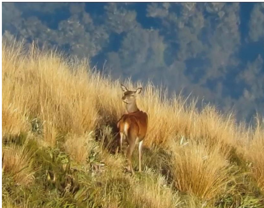
Second Place Tom Cliffe - "Hind Looking Back"