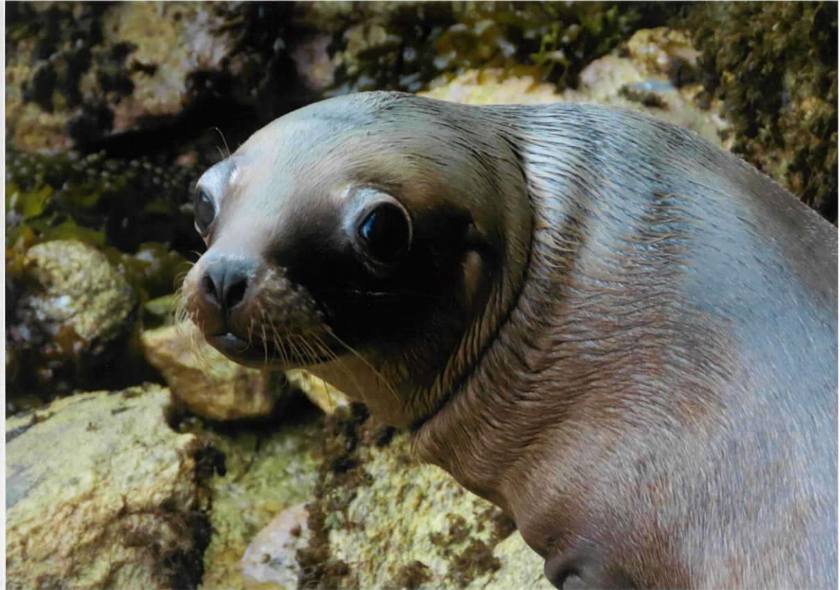
Second Place Paul Psychers - "Sea Lion Pup"