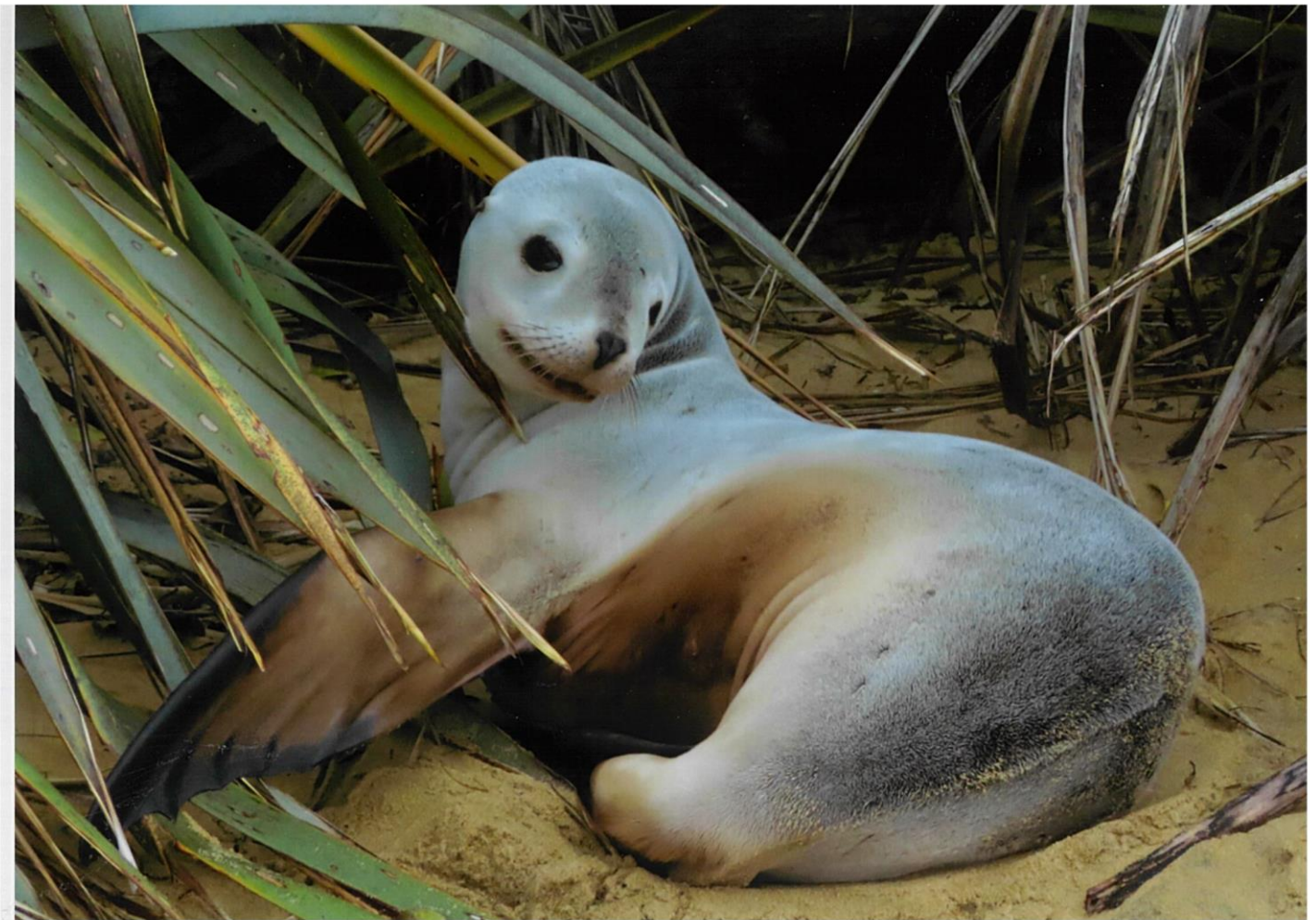
First Place Paul Peychers - “Sea Lion”