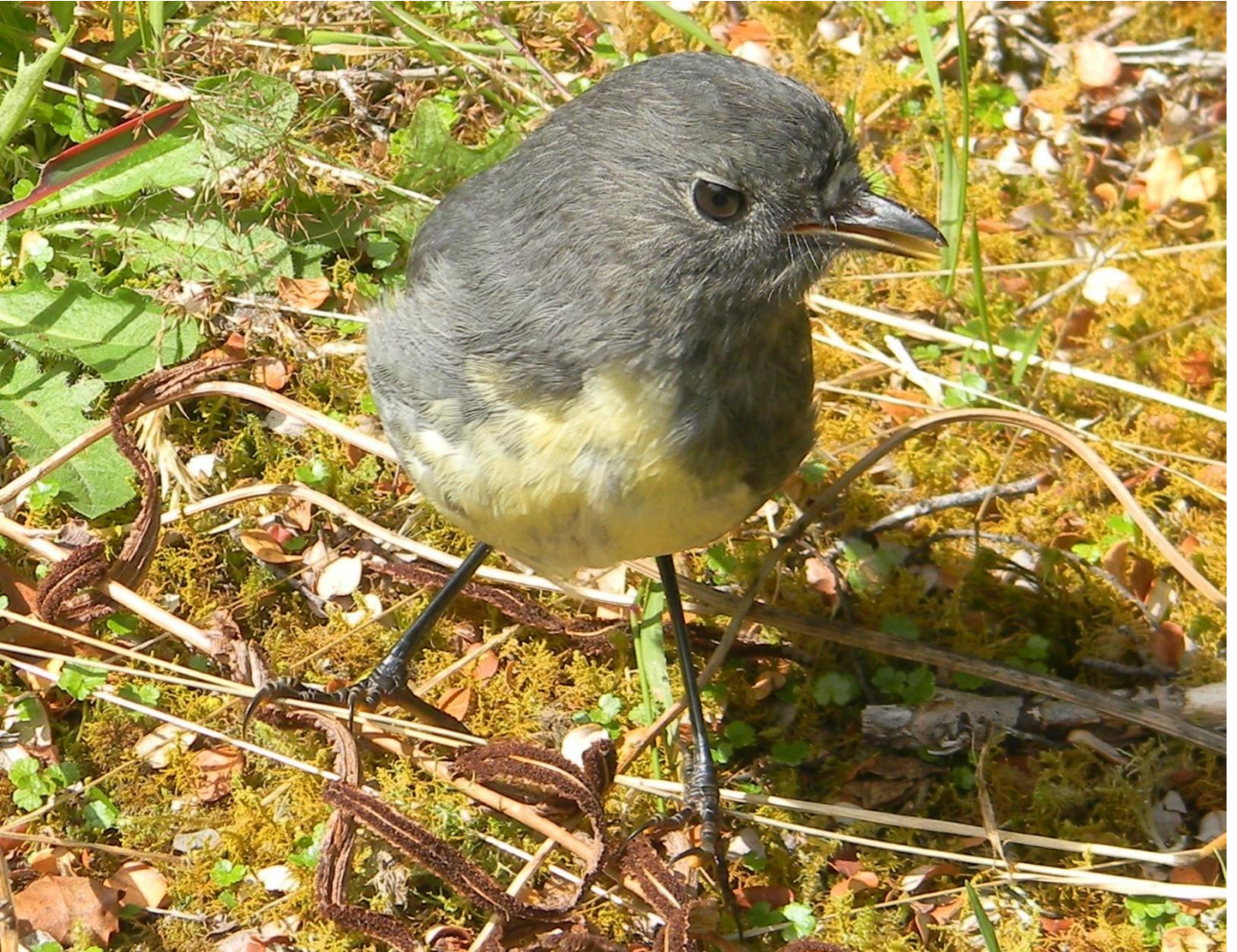
First Place Warren Plum – “Robin”