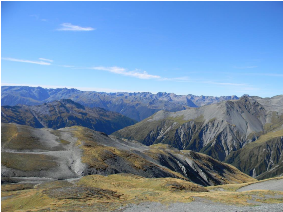
Second Place Warren Plum – “Nelson Lakes”