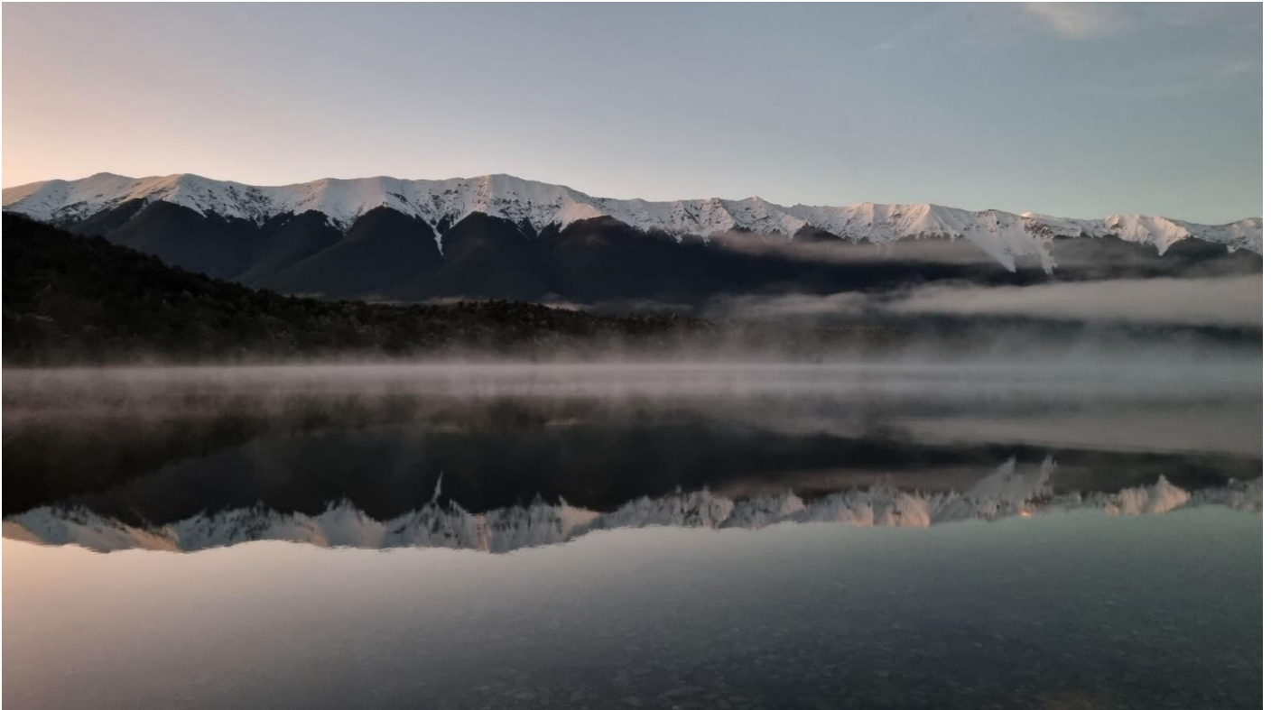
First Place Cory Jones – “Reflection”