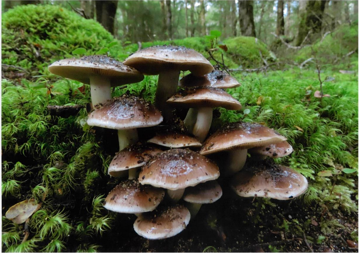
Third Place Paul Peychers – “Fungus 2”