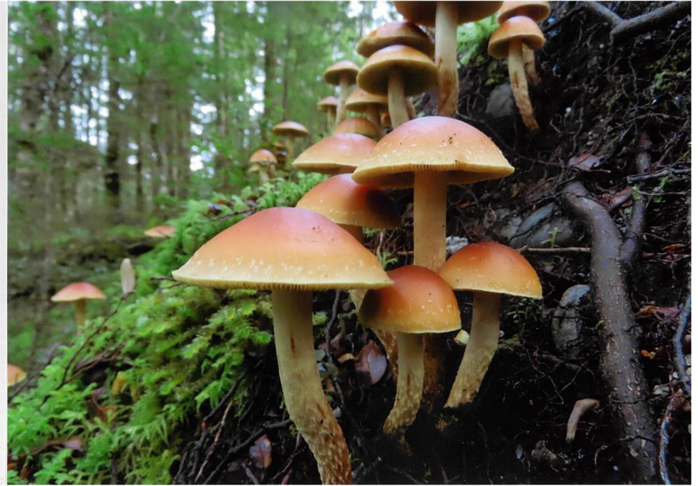
First Place Paul Peychers – “Kepler Track Fungi”