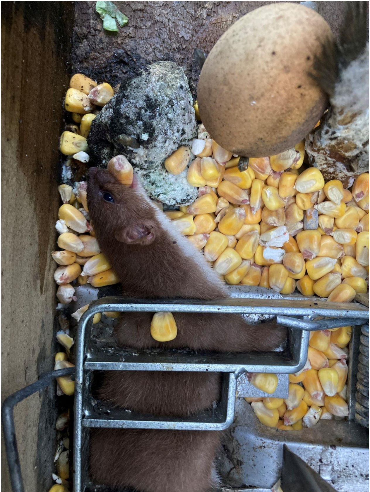
A-maizing – weasel gone vegetarian but who cares?. Caught at Packers Creek Range