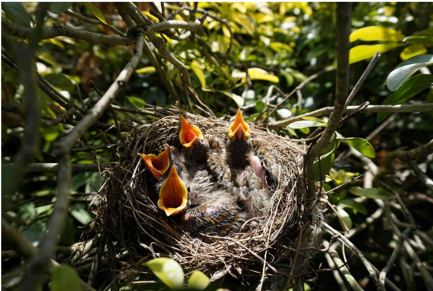
Livingstone Cup (Native Birds) – Aaron Shields