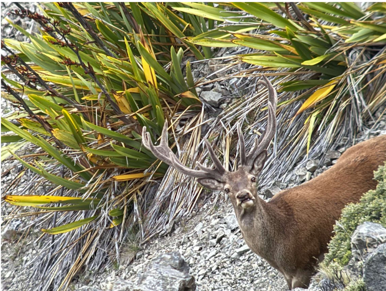
Tantrum Cup (Wildlife - Game Animals) – Aaron Shields