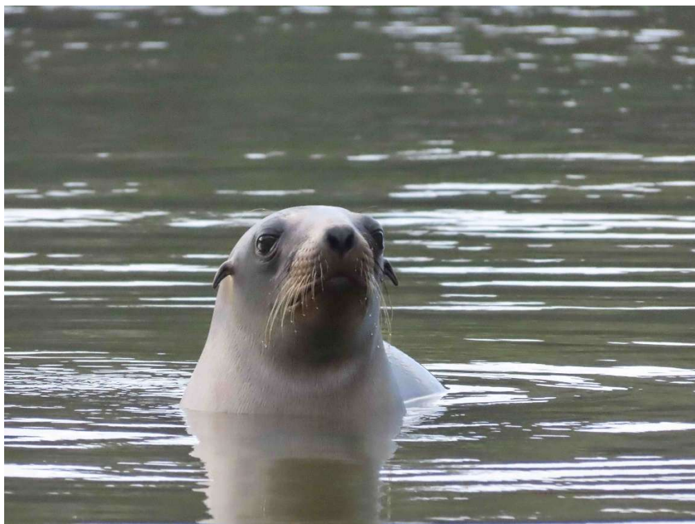
Other Wildlife (Mammals)