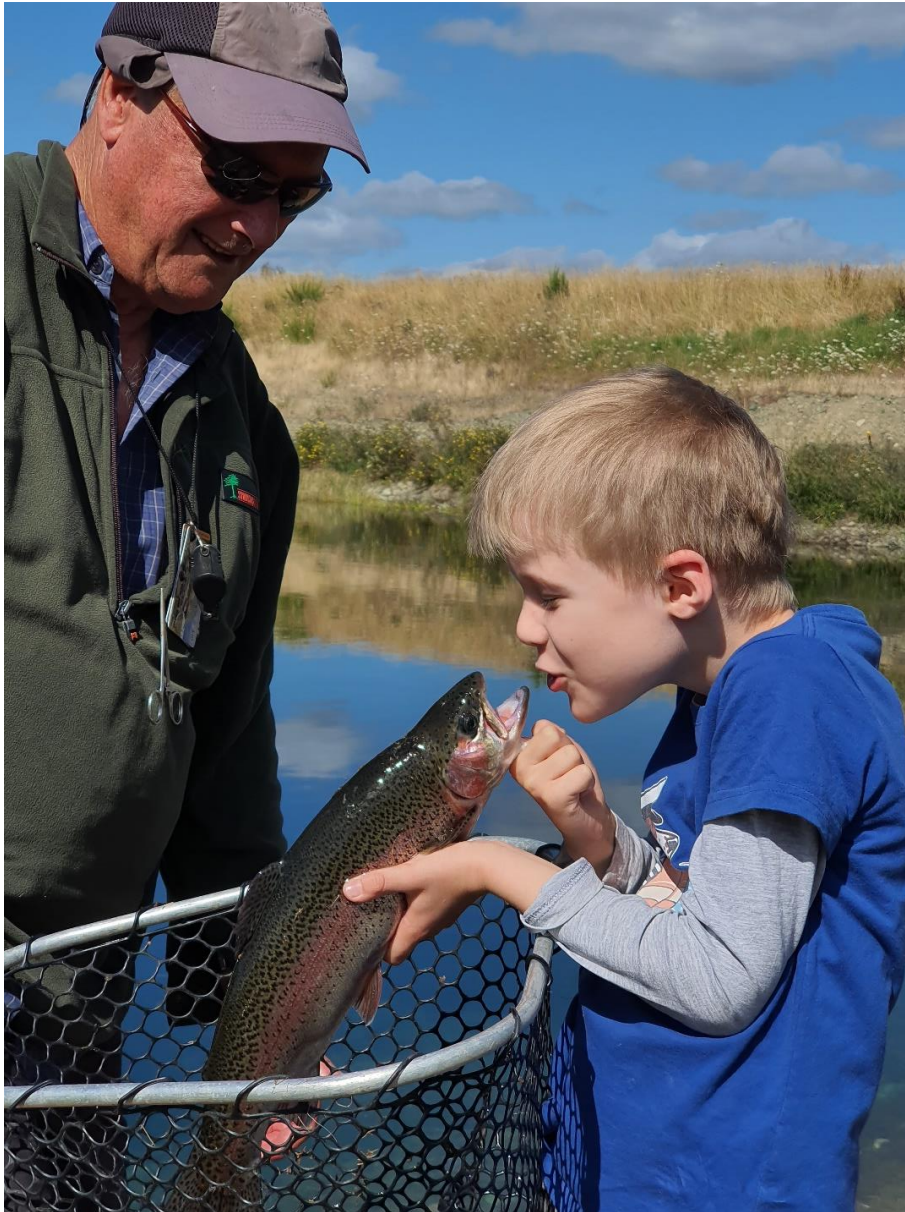
This is what granddads do over the school holidays, they take grandkids fishing

Newsletter of Nelson Branch NZDA February 2020