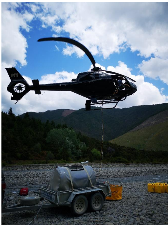
Tasman Helicopters flying a Eurocopter to transfer rainbow trout into the Branch Leatham