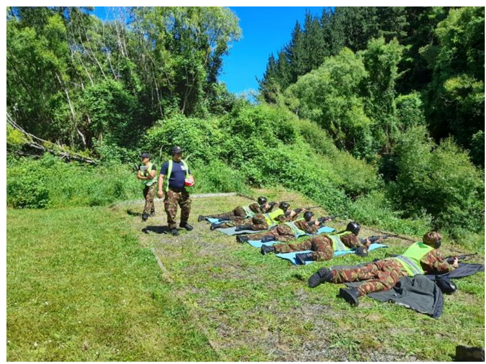
Motueka army cadets participating in their first shoot on our short range