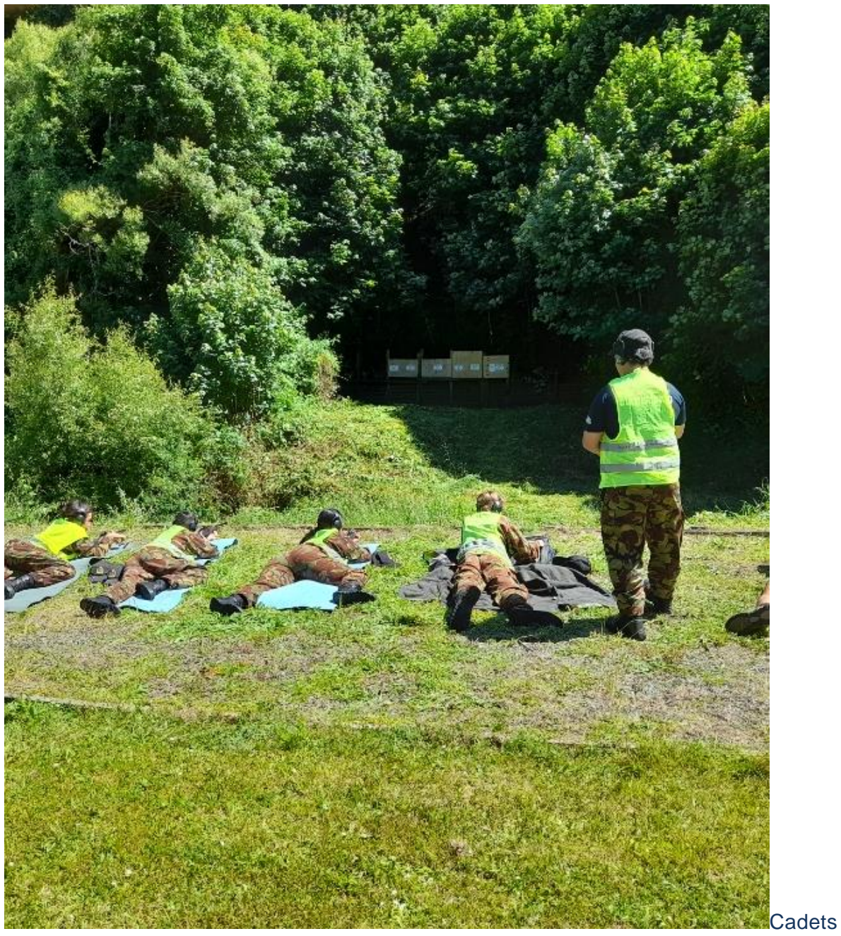
shooting on the range after they cut scrub and generally tidied the range.