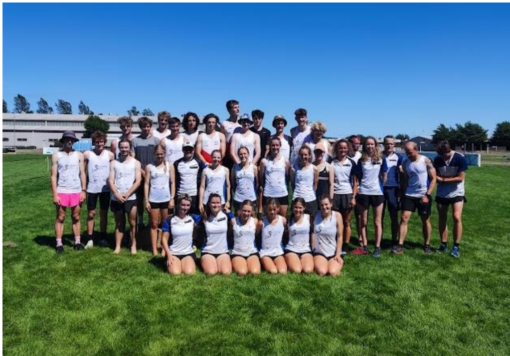
The Southerly Storm featuring some of the Nelson members.