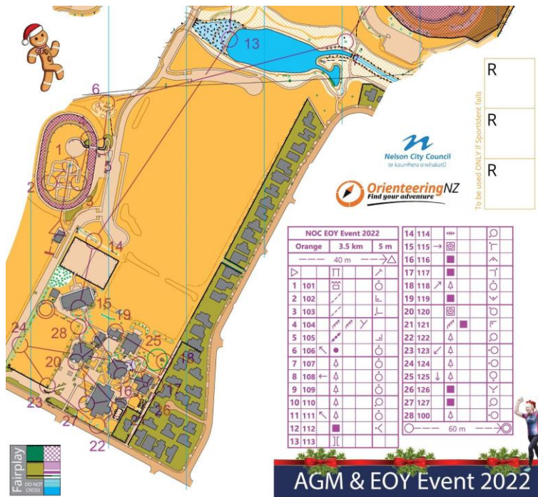
Part of the Orange course from the EOY event.