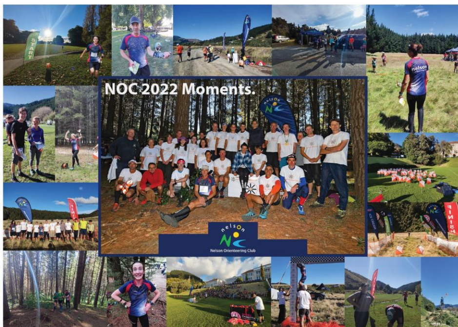
NOC 2022 Moments.

The President has managed to summarise the year we've had in his report. Be sure to check it out!