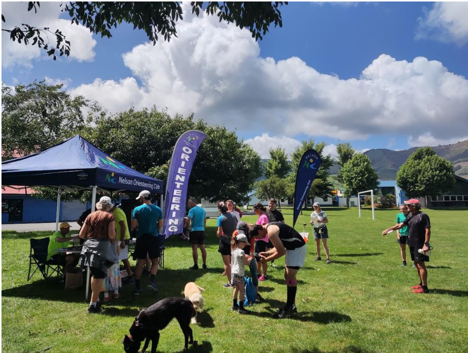
AGM and EOY Event last Sunday at Garin College.