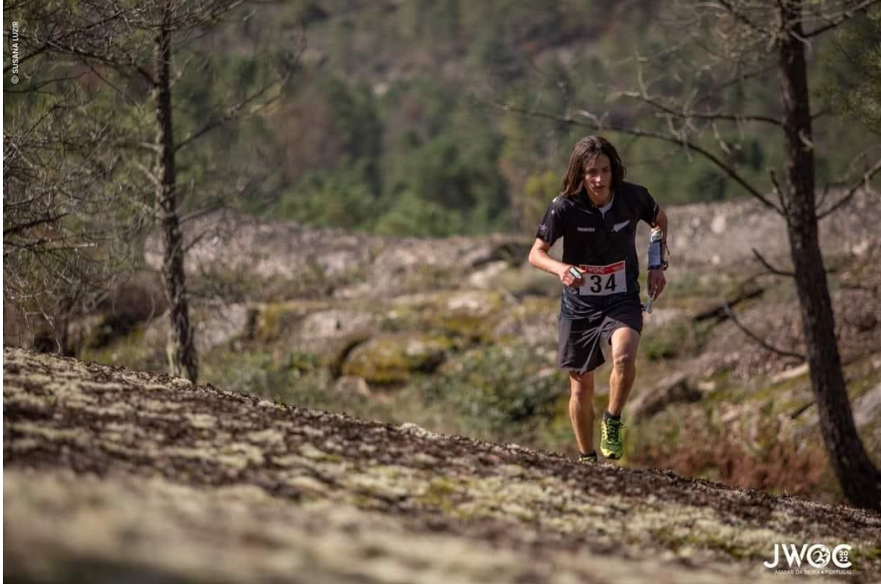
Zefa at JWOC 2022