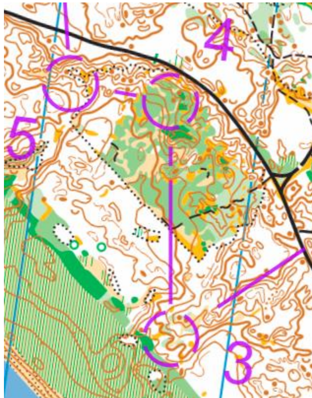
Leg 3-4 from Day 2 of the Men's 21E course, what would your route be?

A small contingent from Nelson Orienteering Club travelled up to Auckland for the Northern Orienteering Champs. Day 1 and 2 were multi-day distance events and day 3 was a chasing start. Matt Ogden and Zefa Fa'avae dominated the M21E field, placing 1st and 2nd respectively at the end of day 3.