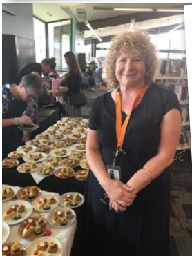
New Lynn Business Association supporting New Lynn Library events