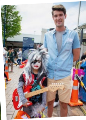
Children's Dress Up - another New Lynn Business Association supported community event