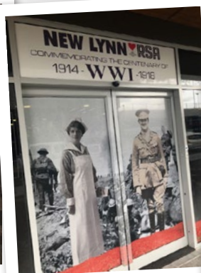
Supporting your local RSA.