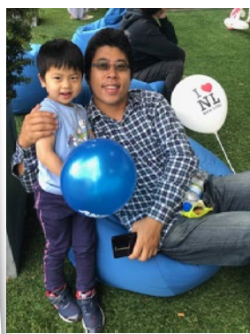
Christmas 2018 in New Lynn. A fabulous community event.