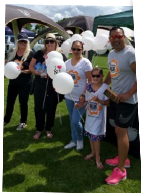
New Lynn Business Association supports Sirens and Sounds