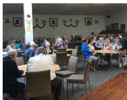
The New Lynn RSA Veterans event December 2018.