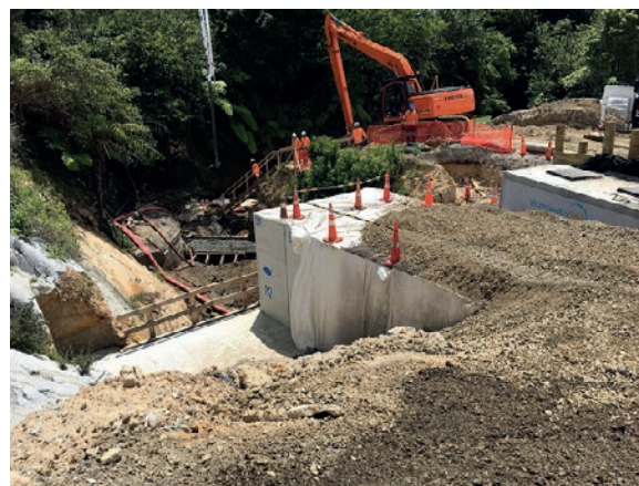
Reinstatement work: To the right of the photo the new stormwater treatment filter tank can be seen. The outlet of the new culvert for high flows is in the centre and in the background work is proceeding on the foundations for the erosion control weir.