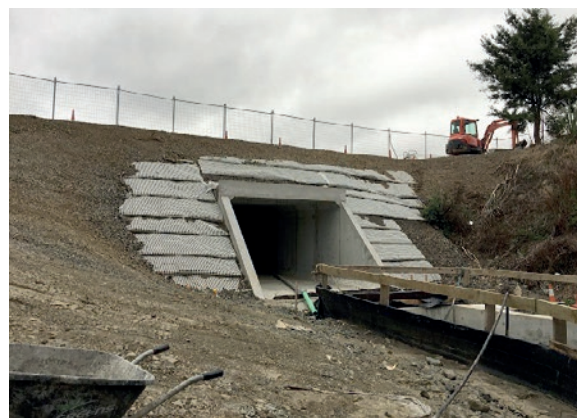
Newly installed culvert, upstream end

This part of the project is additional to the primary project, but with the support of the local business community, an opportunity to provide further amenity to benefit the whole community arose. It was then agreed that the work could be done at the same time as the culvert upgrade.