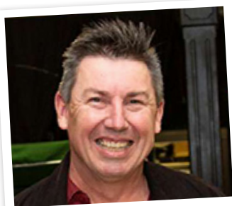
Phil Parker Autocare New Lynn

The New Lynn Business Association committee are volunteers, they contribute time and energy to the New Lynn business community and we would like to acknowledge past and present business owners and thank them for their time, effort and guidance in supporting business betterment in New Lynn