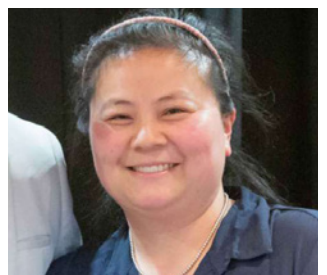
Norah Ding Little Treats Café