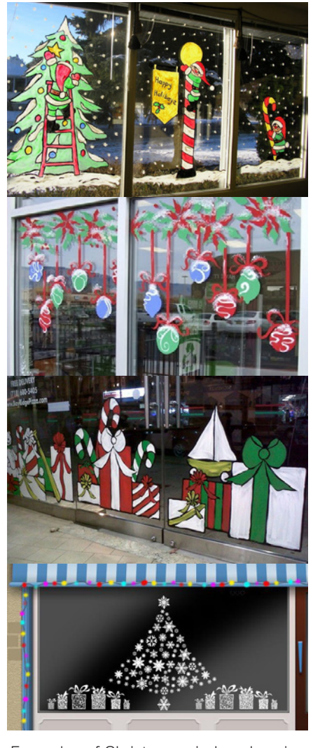
Examples of Christmas window dressing

In late October, the NLBA holds the annual AGM, we remind you that this is fast approaching. We do encourage you to participate and attend the AGM.