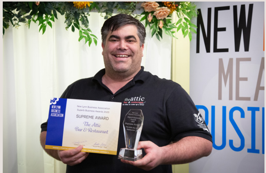
Best Restaurant or Bar and Supreme Award Winner The Attic Bar & Restaurant