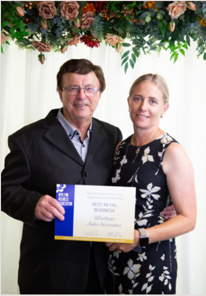
Best Retail Business Woottons Auto Accessories