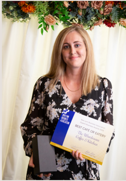
Best Café or Eatery The Wardroom Coffee & Kitchen