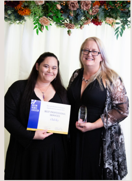
Best Professional Services Club K9