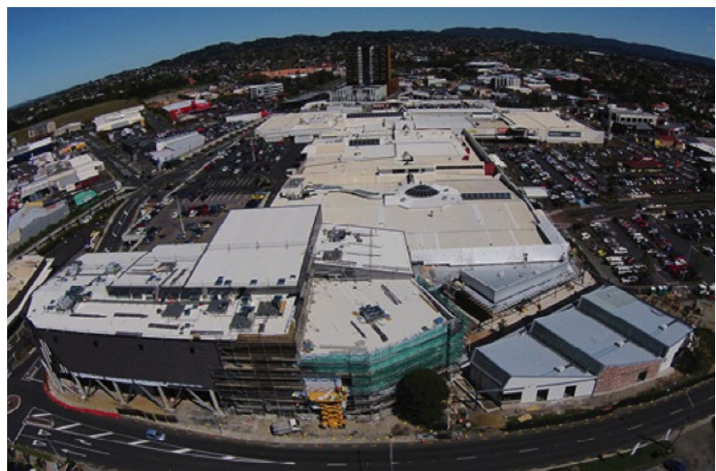
September 2015 - The Brickworks & Reading Cinemas coming together so quickly: Kiwi Income Property website image October 2015

LynnMall continues the development of the cinema complex and the new eateries. This development is proposed to open on 5th November 2015. More information about the project can be found at http://www.lynnmall.co.nz/lynnmall-development .