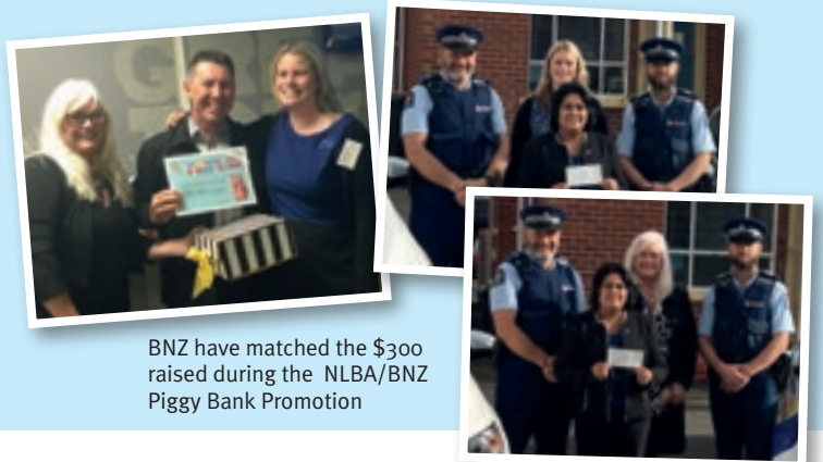
BNZ have matched the $300 raised during the NLBA/BNZ Piggy Bank Promotion