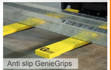
Anti slip GenieGrips

www.momentumequipment.co.nz | 0800 666 368 | admin@momentumequipment.co.nz