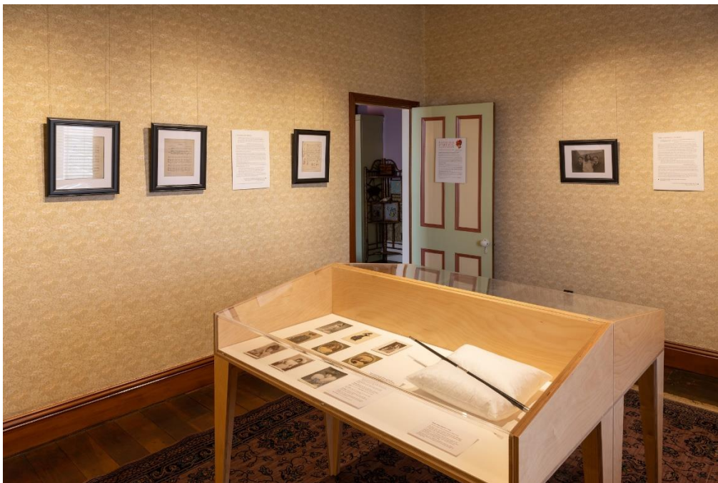
Looking towards the door in the north-west corner