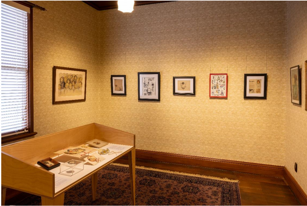
Looking towards the south wall