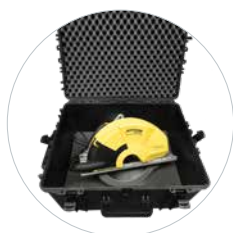
Optional: Transport case with wheels Ref. 60827Box