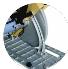
Depth adjustment with scaling