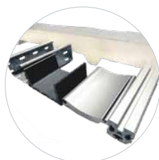
Examples of cuts