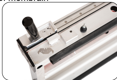
Works with conventional hooked blades: Changing blades is easy and fast