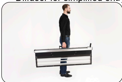
Compact and light