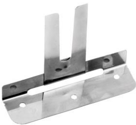
Illustration Sliding clip with bifurcated "V" clip: